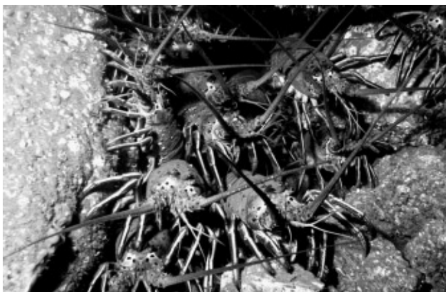
California Spiny Lobster, Panulirus interruptus

Recreational harvesters need a valid sport fishing license with an ocean enhancement stamp, and may use hoop nets or bare (gloved) hands when skin or scuba diving for lobster. No appliance, such as a fish spear or a short hooked pole, may be used to snag the animals from deep crevices or caves. The daily bag limit for sport fishing is seven lobsters, reduced from 10 in 1971.