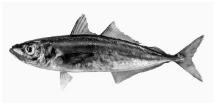
Jack Mackerel, Trachurus symmetricus

Large jack mackerel have occasionally contributed to the commercial passenger fishing vessel (CPFV or partyboat) sport fishery. In 1953, a run of large fish was encountered in southern California, which contributed 13 percent of the CPFV catch in southern California and 8.6 percent