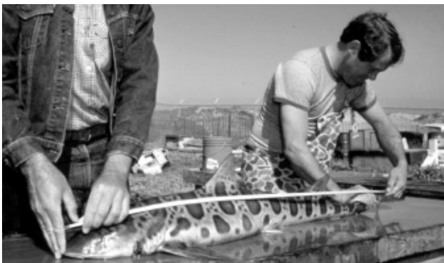
Leopard Shark, Triakis semifasciata

The live-bearing female leopard shark produces from seven to 36 offspring in an annual reproductive cycle. Males mature at seven years, and females at 10 years, when fish reach lengths between 40 and 42 inches total length. The gestation period is estimated at 10 to 12 months. Birth apparently takes place from March through July. The only known eye-witness account of leopard sharks giving birth in the wild is that of a fisherman who observed "pupping" activity at Santa Catalina Island in southern California in the 1940s. Dozens of large females,