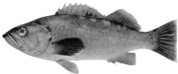
Olive Rockfish, Sebastes serranoides

Olive rockfish occur from southern Oregon to Islas San Benitos (central Baja California) from barely subtidal waters to 570 feet (the latter based on a trawl specimen collected by the Southern California Coastal Water Research Project). They are common from about Cape Mendocino to Santa Barbara and around the Northern Channel Islands from surface waters to about 396 feet. Olives appear to be uncommon off much of both southern California and Baja California.