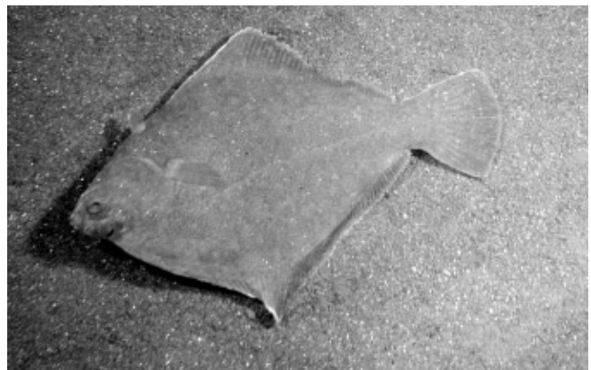
Diamond Turbot, Hypsopsetta guttulata

In general, flatfish spawn during late winter and early spring. Arrowtooth flounder, however, spawn as late as August in the southeast Bering Sea and Gulf of Alaska, where the greatest concentrations of this species are found. The larvae are pelagic and undergo metamorphosis to the adult form. After flatfish settle on the bottom, they eat small crustaceans, polychaetes, and mollusks. As they grow, they eat larger food forms of the same groups. Some, such as sand sole, arrowtooth flounder, and Pacific halibut, include fish in their diet.