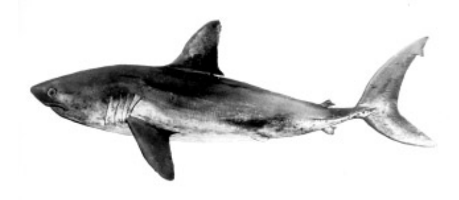
Salmon Shark, Lamna ditropis