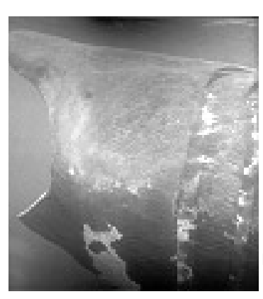
Basking Shark, Cetorhinus maximus

Basking sharks are presumed to be ovoviviparous, but whether they have intrauterine cannibalism like other lamnoids is uncertain. Gravid females have never been observed in this species. Males mature at about 13 to 16 feet, and females at about 27 to 29 feet. The maximum size for this species is 36 feet. The smallest recorded free-living basking shark measured 5.6 feet, but size at birth is unknown. Maturity has been estimated at six to seven years, although the aging technique has never been verified for this species and may underestimate the age by one-half. These sharks may live for 30 to 50 years or