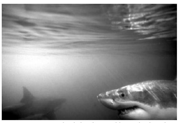
White Sharks circling research boat, Carcharodon carcharias