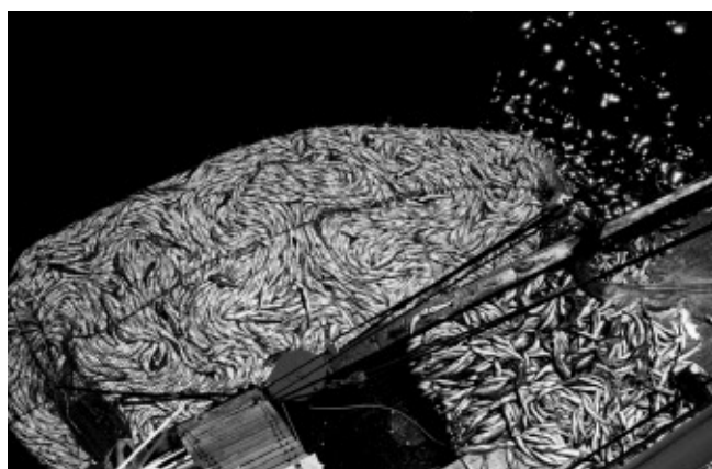
A catch of Pacific Hake is brought aboard

Hake are a favorite prey for a great many creatures, especially marine mammals such as seals, sea lions, porpoises, and small whales. Hake have also been found