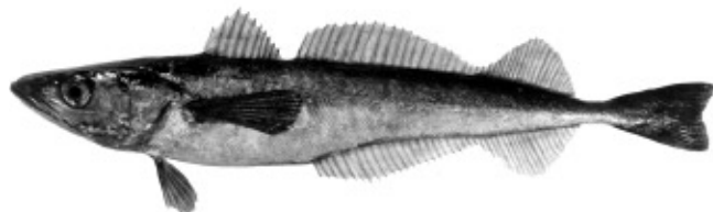
Pacific Hake, Merluccius productus

The joint venture fishery for Pacific hake started in 1978 between foreign nations and the United States and Canada. Consistent with the intent of the MFCMA to encourage development of domestic fisheries, landings of hake declined in the foreign directed fishery while increasing in the JV fishery. In 1978, the foreign catch amounted to 98 percent of the total hake catch in the U.S. management zone. The foreign catch declined to 11 percent of the total by 1988, and in 1989 there was no foreign catch. U.S. fishermen harvested the entire annual hake quota in 1989, eliminating the foreign directed fishery, and in 1991