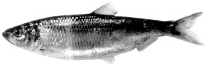
Pacific Herring, Clupea pallasii

Herring ovaries (commonly referred to as "skeins" by those in the fishing industry) are brined and prepared as a traditional Japanese New Year's delicacy called "kazu-noko." Brined skeins are leached in freshwater overnight and served with condiments or as sushi. Most herring taken in California are trucked from the port of landing to a processing plant for removal of skeins and brining and grading. Skeins are graded by size, color and shape, packed in plastic pails, exported for sale, and auctioned. Some herring are frozen and exported to China for processing where labor costs are low. Herring skeins from San Francisco Bay are typically smaller in size than those produced in British Columbia and Alaska but are highly valued for their unique golden coloration.