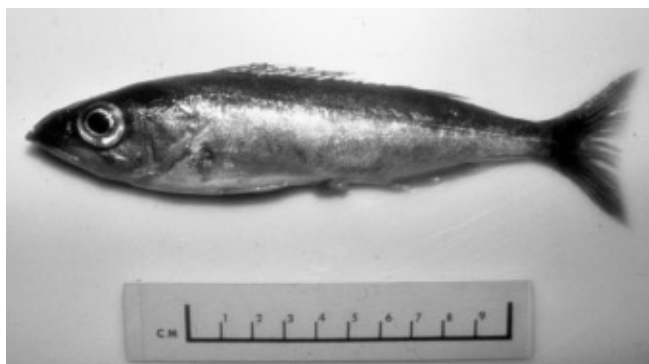
Shortbelly Rockfish, Sebastes jordani

The potential fishery for shortbelly rockfish is controversial. Some fishermen express concern that significant amounts of salmon may be caught incidentally to fishing for shortbelly rockfish, but scientists have not observed incidental salmon catches on numerous research cruises and believe that a fishery for shortbelly rockfish is likely to be offshore from concentrations of salmon. Fishermen and environmental groups also express concern because young-of-the-year shortbelly rockfish are forage for salmon, sea birds and marine mammals. Scientists have recommended quotas that are thought to be sufficiently low so as not to impact either the recruitment or the availability of young-of-the-year shortbelly rockfish for forage. Scientists have also recommended close monitoring of fishing for shortbelly rockfish to verify that high incidental catches of this species and/or depletion of forage do not occur.