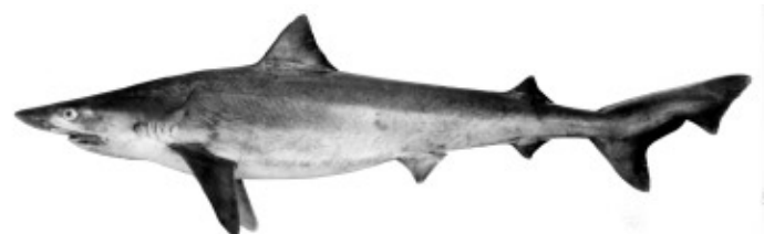
Soupin Shark, Galeorhinus galeus

Soupfins readily forage on both demersal and pelagic bony fish species, although larger individuals prefer cartilaginous fishes. Invertebrate prey includes cephalopods, crabs, shrimp, and lobster. Young sharks tend to feed more heavily on invertebrates than do adults. Natural predators on soupfins, particularly juveniles, include the white shark, sevengill shark, and possibly marine mammals.