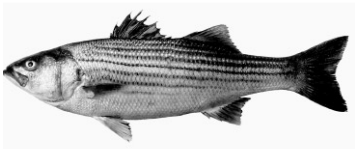
Striped Bass, Morone saxatilis

Exploitation rates have been estimated almost annually since 1958. They have varied from nine percent (1989, 1992, and 1994) to 28 percent (1963) except for an unusually high 37 percent in 1958. Exploitation in the San Francisco Bay estuary is lower than for historic exploitation