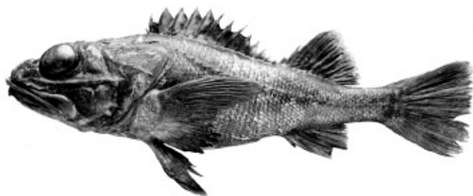
Longspine Thornyhead, Sebastes altivelis

The west coast fishery for thornyheads first developed in northern California during the 1960s, when large thornyheads (primarily shortspine, minimum size 12-14 inches) were marketed as rockfish fillets in domestic markets.