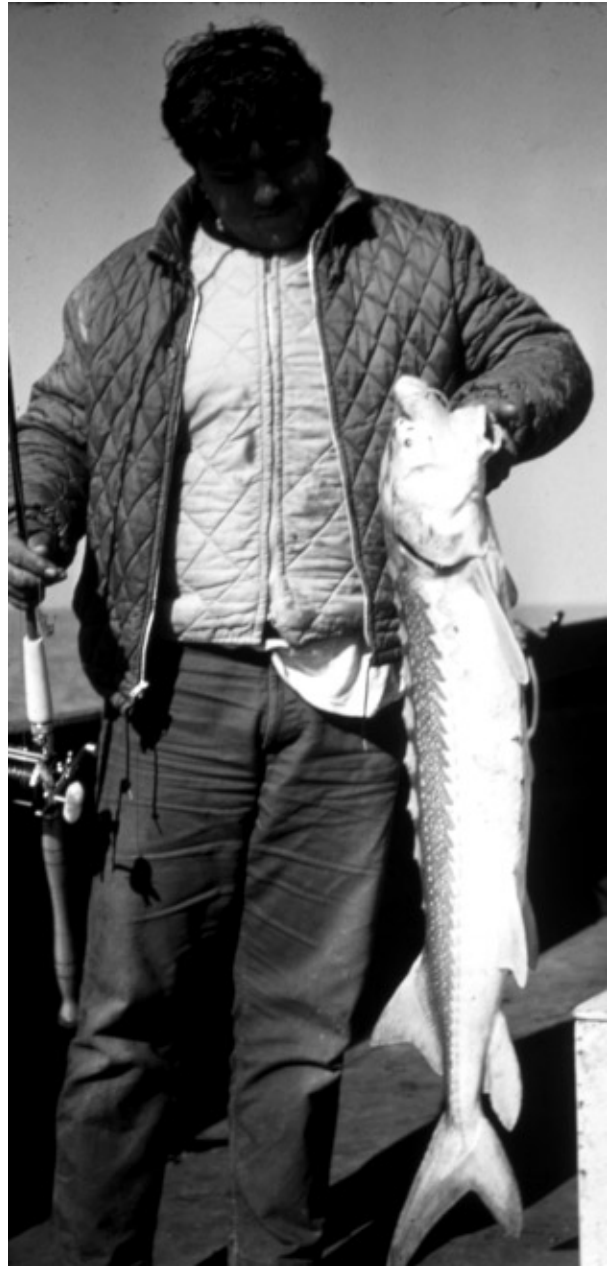
Angler holding a white sturgeon