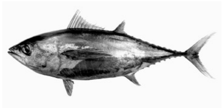
Yellowfin Tuna, Thunnus albacares

Longliners, based in California, started fishing in the eastern Pacific in 1991. These vessels usually targeted bigeye tuna or swordfish outside the California 200-mile Exclusive Economic Zone (EEZ) and yellowfin tuna are an incidental catch in this fishery. Longliners usually fish between 30° N