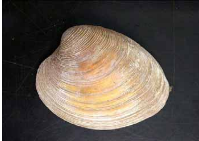
Manila clam, Venerupis philippinarum .