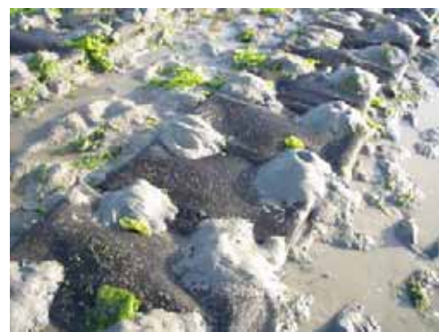
Figure 19-2. Mesh grow out bags filled with Manila clam seed in Tomales Bay.

Clam seed is purchased by growers at either 0.16 inches (0.41 centimeters) or 0.24 inches (0.61 centimeters), and is placed in plastic mesh bags with 0.13 inch (0.33 millimeter) or 0.25 inch (0.64 millimeter) mesh, respectively. If smaller seed is used, the clams are transferred to the larger mesh bags when they grow to an appropriate size (greater than 0.25 inches; 0.64 centimeters). Pea gravel and pieces of crushed oyster shell are placed in the bags as substrate for the small clams to attach themselves. The bags are placed into shallow trenches to allow some of the sandy bottom to cover and protect the developing clams. Mud is placed on each of the four corners of the bags to weigh them down (Figure 19-2). The grow out process takes approximately 2 years from the time the clams are placed in the 0.25 inch mesh bags