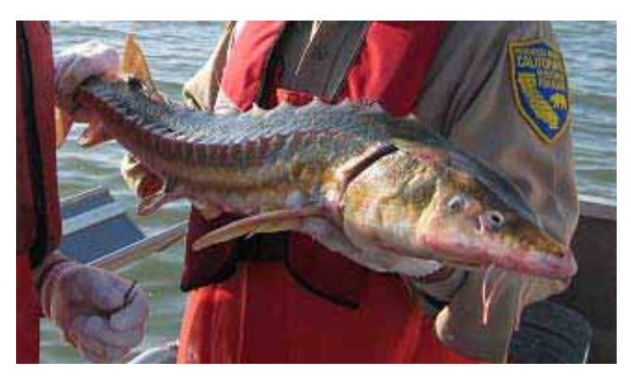
Figure 6-2. Green Sturgeon, Acipenser medirostris .

white sturgeon. Spawning populations have been found only in medium sized rivers from the Sacramento-San Joaquin River system northward. Current California spawning areas are believed to include the Klamath River Basin and the Sacramento River. Green sturgeon have been reported from the Feather, Yuba, Bear, Trinity and Eel rivers, but it is unclear if spawning takes place in these rivers. There is no evidence to indicate that green sturgeon were historically present or are currently present in the