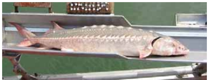
White Sturgeon, Acipenser transmontanus .