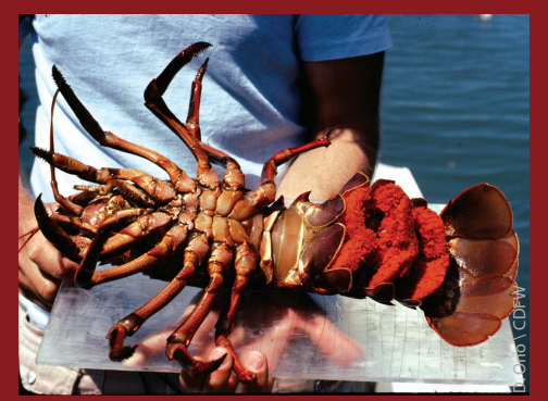
A "berried" female lobster with thousands of bright orange eggs attached to the swimmerets on the underside of her tail.

Spiny lobster usually move into shallow water during spring and summer, and migrate to deeper water in fall and winter. Adult lobster have been found as deep as 240 feet during the winter, possibly to avoid the effects of stormy weather.