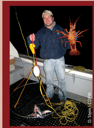
Traditional hoop net with two large metal rings joined by collapsible mesh netting.

Use an oily or aromatic bait to disperse a scent trail that nearby lobster can follow back to the net. Common baits such as squid, Pacific mackerel, bonito, anchovies, sardines, and even meats like raw chicken are proven lobster attractants. Perforated cans of cat food are another option. Invest in a wire mesh bait container to guard against loss of bait to fish or other large predators such as seals and sea lions.