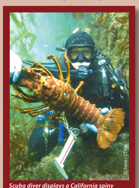
lobster. When attempting to capture lobster, avoid grasping the legs or antennae as lobster that escape with broken appendages produce fewer offspring while recuperating.

The California spiny lobster, Panulirus interruptus , is common from Point Conception, California to Magdalena Bay on the west coast of Baja California, Mexico.