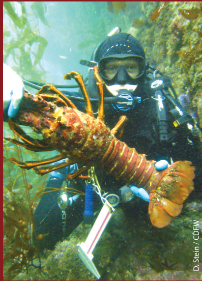
Scuba diver displays a California spiny lobster. When attempting to capture lobster, avoid grasping the legs or antennae as lobster that escape with broken appendages produce fewer offspring while recuperating.

The California spiny lobster, Panulirus interruptus , is common from Point Conception, California to Magdalena Bay on the west coast of Baja California, Mexico.