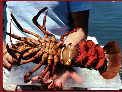
A "berried" female lobster with thousands of bright orange eggs attached to the swimmerets on the underside of her tail.

Spiny lobster usually move into shallow water during spring and summer, and migrate to deeper water in fall and winter. Adult lobster have been found as deep as 240 feet during the winter, possibly to avoid the effects of stormy weather.