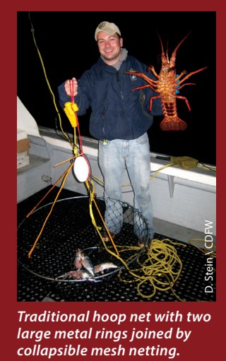
Traditional hoop net with two large metal rings joined by collapsible mesh netting.

One of the easiest and quickest methods for cooking lobster is boiling, which takes only 10 to 15 minutes depending on the size and number of lobster being cooked. Lobster turn bright red when boiled. Broiling and barbecuing are also good cooking choices.