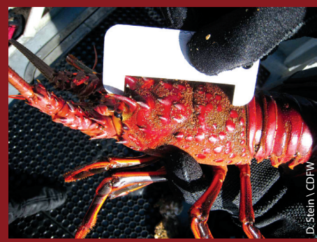
A legal-sized lobster carapace is as large or larger than the fixed gap of the measuring gauge.

🦞 Both lobster divers and hoop netters must carry a lobster gauge when attempting to take lobster. The gauge is a metal or plastic measuring device that has a fixed gap of 3¼ inches for