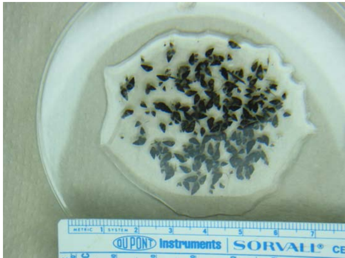
Figure 8. NZMS recovered from one set of wading gear cleaned during the field trials.

The majority of NZMS recovered were associated with wading boots. NZMS were observed on the tongue area of wading boots, associated with the laces or the area of the tongue that was tucked beneath the lacing eyelets. Large numbers of small NZMS were present inside of the boots, having worked down between the boot and the neoprene bootie of the wader. If the boots contained padded insole inserts, NZMS were also found underneath the inserts, associated with sand grains. NZMS were recovered from every treated set of wading gear. Numbers of NZMS per sample (Figure 8) ranged from 1 to 227 with a mean of 33 (Appendix 2). Over 50% of NZMS recovered were ≤ 1 mm in size (Table 4).