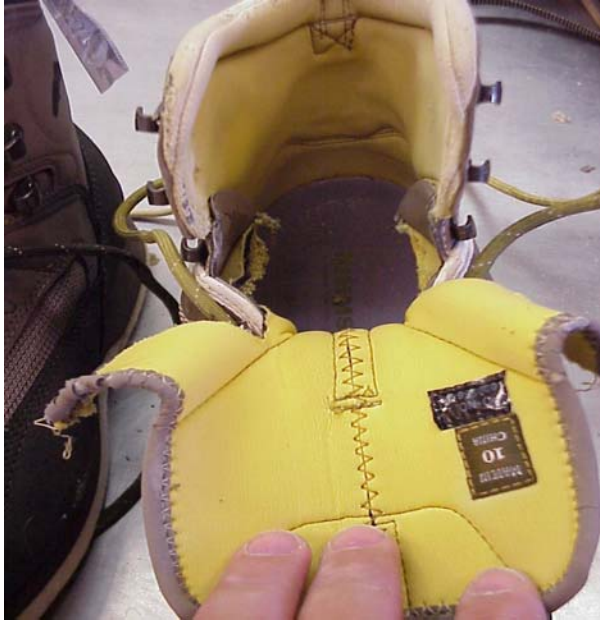
Figure 5. Wader boot exposed to bleach had changed color of boot liner and failure of material where tongue had been sewn.

Pine-Sol® (50% dilution) – Wading gear exposed to Pine-Sol® (50% dilution) continued to emit an odor characteristically associated with the compound several weeks after the tests ceased. The seams of the neoprene booties were weakened and in one case actually failed. The glue used in the seams appears to have been dissolved (Figure 6). Surface cracking of the rubber toe portion was observed for boots. The inside of the leg of the Simms® brand waders exposed to the Pine-Sol® solution exhibited some staining but did not leak.