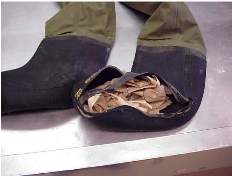
Figure 6. Neoprene bootie exposed to Pine-Sol® had seam failure. The glue appears to have dissolved.

Pine-Sol® (50% dilution) – Wading gear exposed to Pine-Sol® (50% dilution) continued to emit an odor characteristically associated with the compound several weeks after the tests ceased. The seams of the neoprene booties were weakened and in one case actually failed. The glue used in the seams appears to have been dissolved (Figure 6). Surface cracking of the rubber toe portion was observed for boots. The inside of the leg of the Simms® brand waders exposed to the Pine-Sol® solution exhibited some staining but did not leak.