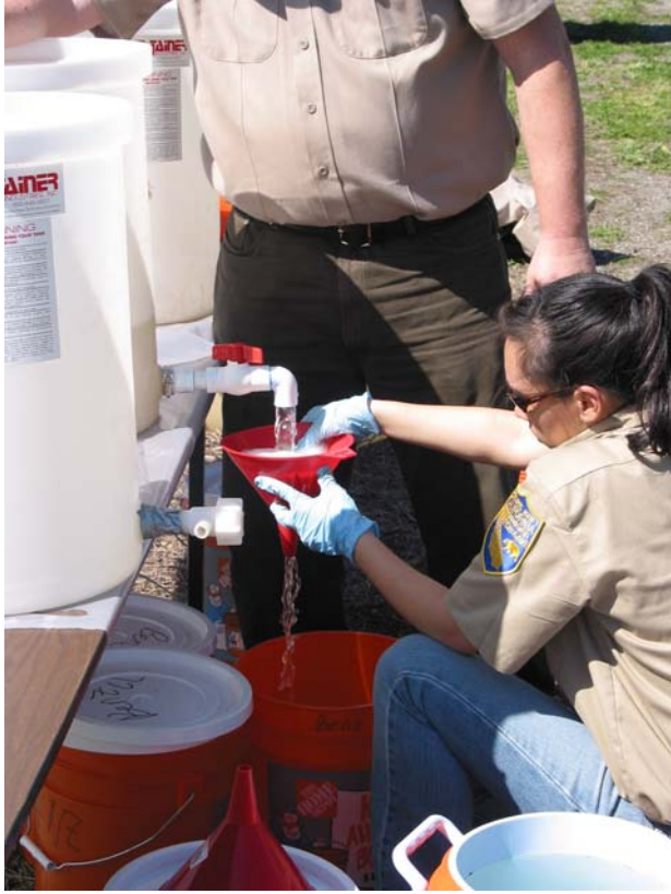
Figure 3. Filtering cleaning solution after removing wading gear.