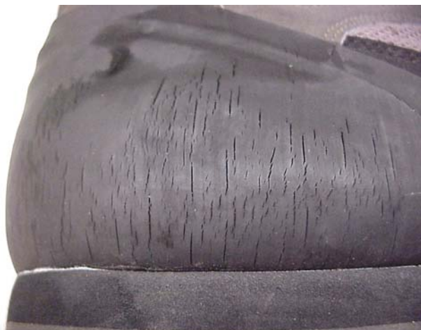
Figure 7. Wader boot exposed to benzethonium chloride had cracking of rubber toe.

Benzethonium Chloride (1,940 mg/L) – The only observed changes in the wading gear exposed to benzethonium chloride were minor, surficial cracking of the rubber toe guard of the boots similar to that observed with Formula 409 ® Disinfectant and Pine-Sol ® exposure (Figure 7), and a loss of surface water repellency (beading of water) on the legs of the waders similar to that observed for Formula 409 ® Disinfectant. Waders exposed to benzethonium chloride did not develop any leaks. The fabric in the waders or the boots did not appear to lose any flexibility.