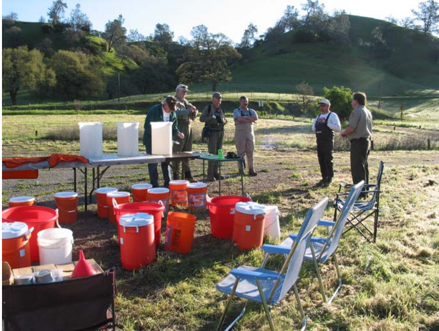
Figure 2. Volunteers participating in the field trials

All wading gear were examined after cleaning to detect the presence of living or dead NZMS. If substrate material (mud, gravel, etc) that could harbor NZMS was present, the gear was rinsed again in fresh water and examined. If substrate material remained, the wading gear was scrubbed using a stiff, nylon-bristled brush until all foreign material was removed. The cleaning solutions and rinse water were filtered through a 500- \mu m mesh nylon net following each cleaning (Figure 3). The filter and filtrate for each pair of wading gear were placed into individually labeled, clean containers with fresh water. The containers were placed on wet ice and returned to the laboratory to identify the numbers of living and dead NZMS. Live NZMS were collected from Putah Creek during the field trials and held in clean containers with fresh water served as process controls.