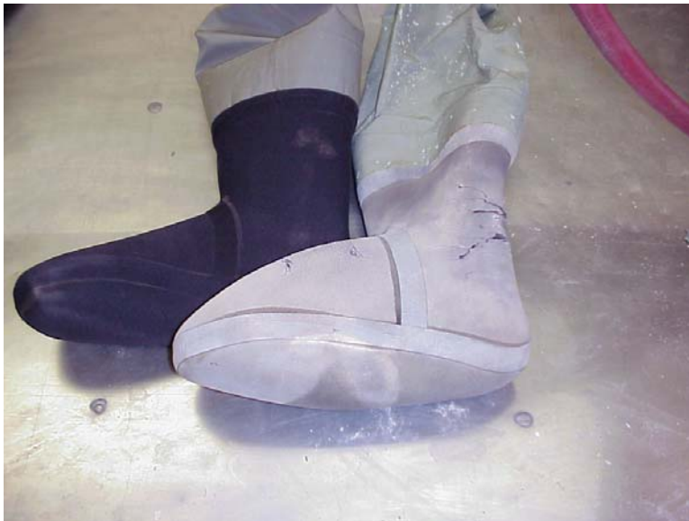
Figure 4. Neoprene wader bootie exposed to bleach (right) compared to bootie exposed to ATL control well water. The fabric of the neoprene bootie exposed to bleach has cracked and lost color.

A All waders were tested for leaks prior to initiation of Phase 2 testing.