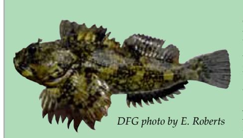
Cabezon may be identified by their large head, lack of scales, and flaps of skin, or cirri, over each eye and in the middle of the snout.

Out of the many correct entries for the May quiz, congratulations go out to Ron Massengill of Cambria, California for correctly identifying last issue's mystery fish as a cabezon, Scorpaenichthyes marmoratus. As of June 9, 2011 the daily bag and possession limit for cabezon is 3 fish within the RCG Complex bag limit of 10 rockfish, cabezon and greenlings in combination.