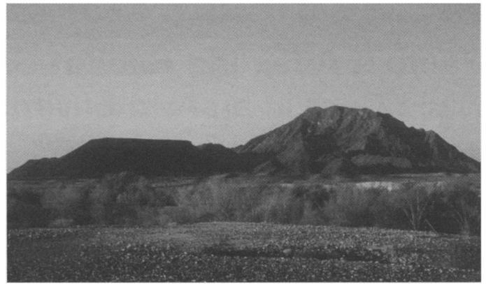
Figure 2. The Cargo Muchacho Mountains, Imperial County, California, USA. Most plant biomass occurred along washes; little vegetation occurred outside these zones.

Several water sources were available to deer in the study area. The Colorado River flowed along the east side of the study area (Fig. 1). An agricultural canal (the All-American Canal) formed part of the southeastern and southern boundary of the study area. To the east of Ogilby Road were 17 wildlife water developments (i.e., catchments) at an average density of 1/35\text{ km}^2 . There also