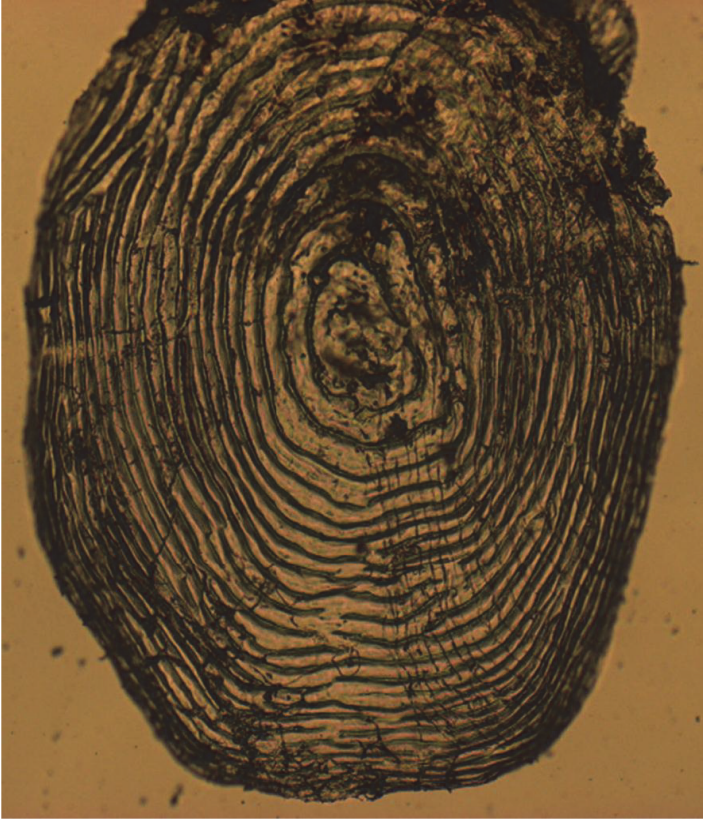
FIGURE 2. —Scale from a 213 mm age 2 O. mykiss in Topanga Creek, Los Angeles County, California, collected in November 2010.

phenomenon. Upper lethal temperatures for salmonids tend to be much higher when fish have been gradually acclimated to warmer temperatures (Cherry et al. 1977, Threader and Houston 1983), as would occur in a stream such as Topanga Creek where stream temperatures are warm most of the year. Summer growth at higher temperatures may also be supported by food availability that is more than sufficient to maintain the bioenergetic demands of the fish during a time when their metabolic rates may be very high. Boughton et al. (2007) experimentally increased food supply for juvenile O. mykiss in a southern California stream to see if there was a growth response related to temperature and found that the variation (fluctuation) in water temperature was as important as the mean water temperature in allowing fish to convert food into growth. It has also been suggested that some O. mykiss populations may be better adapted to higher water temperatures and may have a higher temperature range within which growth is optimal (Spina 2007).