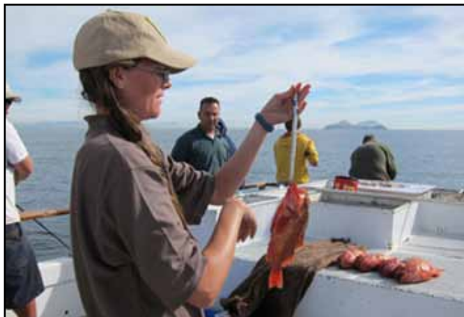
Collecting recreational fishing data aboard a party boat.

Notable cases of collaborative design include all the component surveys that comprise the California Recreational Fisheries Survey. In one survey, observers stationed onboard party boats (commercial passenger fishing vessels, or CPFVs) record catches and discarded fish. In another survey, licensed anglers are interviewed on the telephone to learn of their fishing effort for the past month. In other surveys, anglers on shore or returning from boat trips are interviewed in the field.