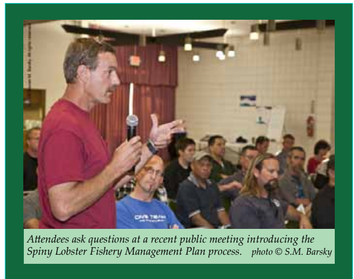
Attendees ask questions at a recent public meeting introducing the Spiny Lobster Fishery Management Plan process.