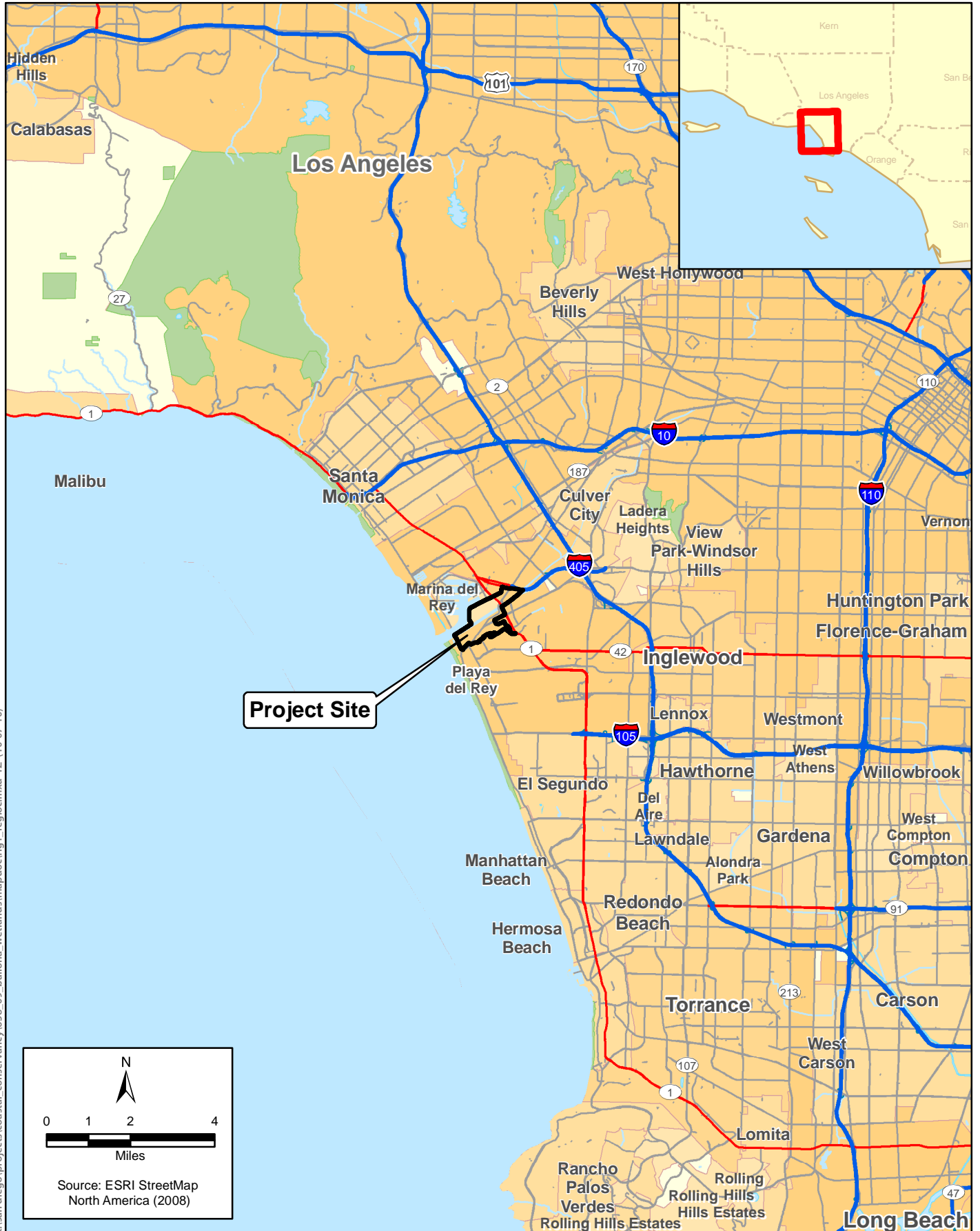
Figure 1 Regional Location