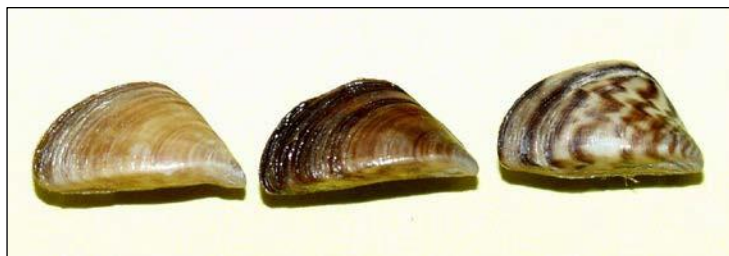
Color variation in quagga and zebra mussels

Quagga and zebra mussels are freshwater mussels that can physically attach onto hard substrates. Like the mussels found clinging to the rocks along the California coastline, quagga and zebra mussels attach onto hard surfaces (e.g. pipes, screens, rock, logs, boats, etc.). They form colonies made up of many individuals attached onto an object and even onto each other. Small newly settled mussels feel like gritty sandpaper when attached to a smooth surface. Larger mussels will feel coarser (like a small pebble or sunflower seed) or be visually apparent.