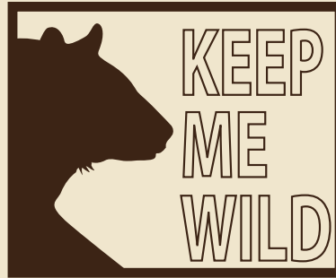
A campaign for all wild animals.