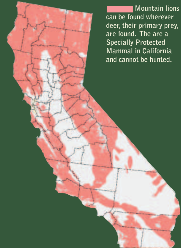
Mountain lion range map

The mountain lion track on the left can be distinguished from the dog track on the right by the absence of toenail prints and by the "M" shaped pad.