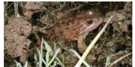
Figure 10. California red-legged frog (USFWS 2003).

One sensitive insect, the sandy beach tiger beetle ( Cicindela hirticollis gravida ), is found in the SCR watershed.