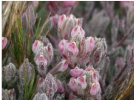
Figure 4. Salt marsh bird's Beak (USFWS 2005).

A diverse variety of wildlife and plant species are associated with the habitat areas of the SCR watershed, some of which are sensitive species. Sensitive plant and animal species are those that are either federally or state listed as endangered or threatened, candidates for listing as endangered or threatened, and those species considered rare or species of special concern by other local public and private resource agencies and organizations. There are seven plant, five fish, 15 bird, eight reptile and amphibian, two mammal and one insect species considered to be 'sensitive' in the SCR watershed.