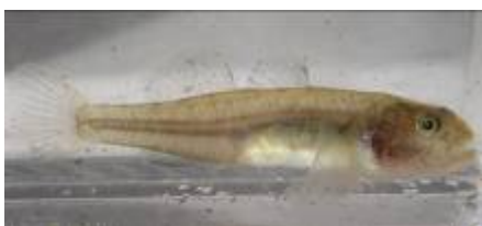
Figure 7. Tidewater goby (USFWS 2004).

The sensitive plants of the SCR watershed include: