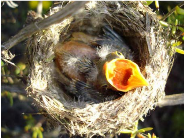
Figure 12. Cowbird chick in California gnatcatcher nest (Griffith Wildlife Biology 2010).

A recent study on cowbird trapping in the Santa Clara River watershed concluded, "Cowbird control is essential to the recovery of small endangered host species. For the vireo, per-pair productivity nearly triples in trapped areas [i.e., areas where cowbirds are trapped] vs. untrapped areas (from ~1.3 to ~3.5 young per pair). This is the difference between decreasing and increasing host populations, between extirpation/extinction and recovery" (Griffith Wildlife Biology 2012).