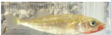
Figure 6. Unarmored threespine stickleback (Dellith 2007).