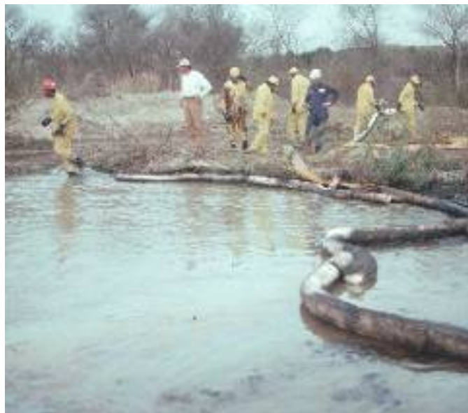
Figure 1. Cleanup of oil in the Santa Clara River.

The oil also impacted the habitat of the unarmored three-spine stickleback ( Gasterosteus aculeatus williamsoni ), listed as an endangered species under the federal Endangered Species Act and the California Endangered Species Act. The Trustees believe that the stickleback population was severely affected by the spill and additional birds, mammals, reptiles, amphibians, and macroinvertebrates were impacted beyond those observed during the response. The ExxonMobil spill and associated response activities (Figure 1) caused injury to riparian habitat in and around the SCR which supports other federal and/or State endangered and threatened species including the least Bell's vireo ( Vireo bellii pusillus ), the southwestern willow flycatcher ( Empidonax trallii extimus ), and the California red-legged frog ( Rana draytonii ). In the NRDA process, the Trustees determined the "damages," a monetary sum sufficient to compensate for the injured natural resources through restoration actions.