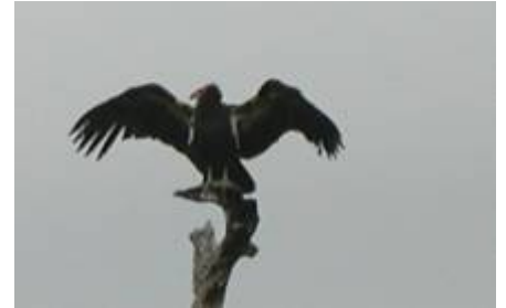
Figure 9. California condor (USFWS 2003).

The sensitive mammals of the SCR watershed include the: