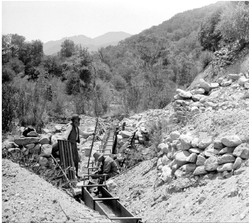
Figure 3. Gold mining sluice in Placerita Canyon, 1800s-1900s. (Image from a glass-plate negative by Frank Evans, Santa Clarita Valley History in Pictures www.scvhistory.com ; Harvey 2007).

During the first half of the 1800s, the raising of livestock on large ranchos became the dominant occupation along the river. In 1842 gold was first discovered in Placerita Canyon (Figure 3), and was mined in many parts of the watershed. Over the latter half of the 1800s, land use along the river shifted from ranching to other forms of agriculture. Oil enterprises also became established during this time. The 1900s brought the railroad, road and bridge construction, and sand and gravel mining, which increased population, urban development and commercial growth. These historical changes resulted in habitat destruction and fragmentation; decreased water quality; diversion of surface, sub-surface and groundwater flows; channelization; encroachment into the floodplain of the river; and the introduction of non-native plant and animal species.