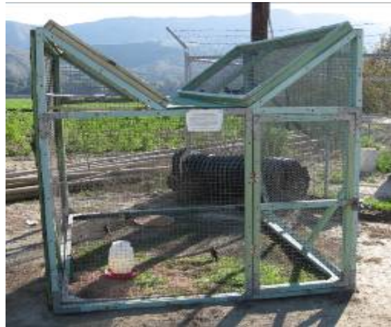
Figure 13. Cowbird control structure near the Santa Clara River (Marek 2008).

The California Department of Fish and Wildlife has implemented cowbird control along the Santa Clara River over the last several years, depending on the funding availability. Cowbird control has also been funded as mitigation for various projects. The Council may partner with the state to assure that funds are available for cowbird control. Furthermore, cowbird control operations are conducted at sensitive sites, nationwide, to promote the recovery of endangered songbirds such as the least Bell's vireo. To control cowbirds, a cage-like structure is placed in an area where cowbirds are found (Figure 13). The cowbirds are attracted to other cowbirds in the structure, enter the cage, are unable to escape, and are then euthanized. The environmental consequence of cowbird control is the death of cowbirds. Although this is unfortunate for a species that has evolved with unique adaptations for survival, the parasitic behavior of the species has interfered with the successful breeding of native birds along the Santa Clara River, such as the federally endangered least Bell's vireo. Cowbird control allows for other native bird species to more successfully reproduce and increase their populations.