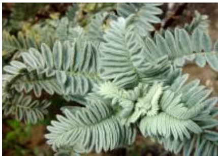
Figure 5. Ventura marsh milk-vetch (USFWS 2003).