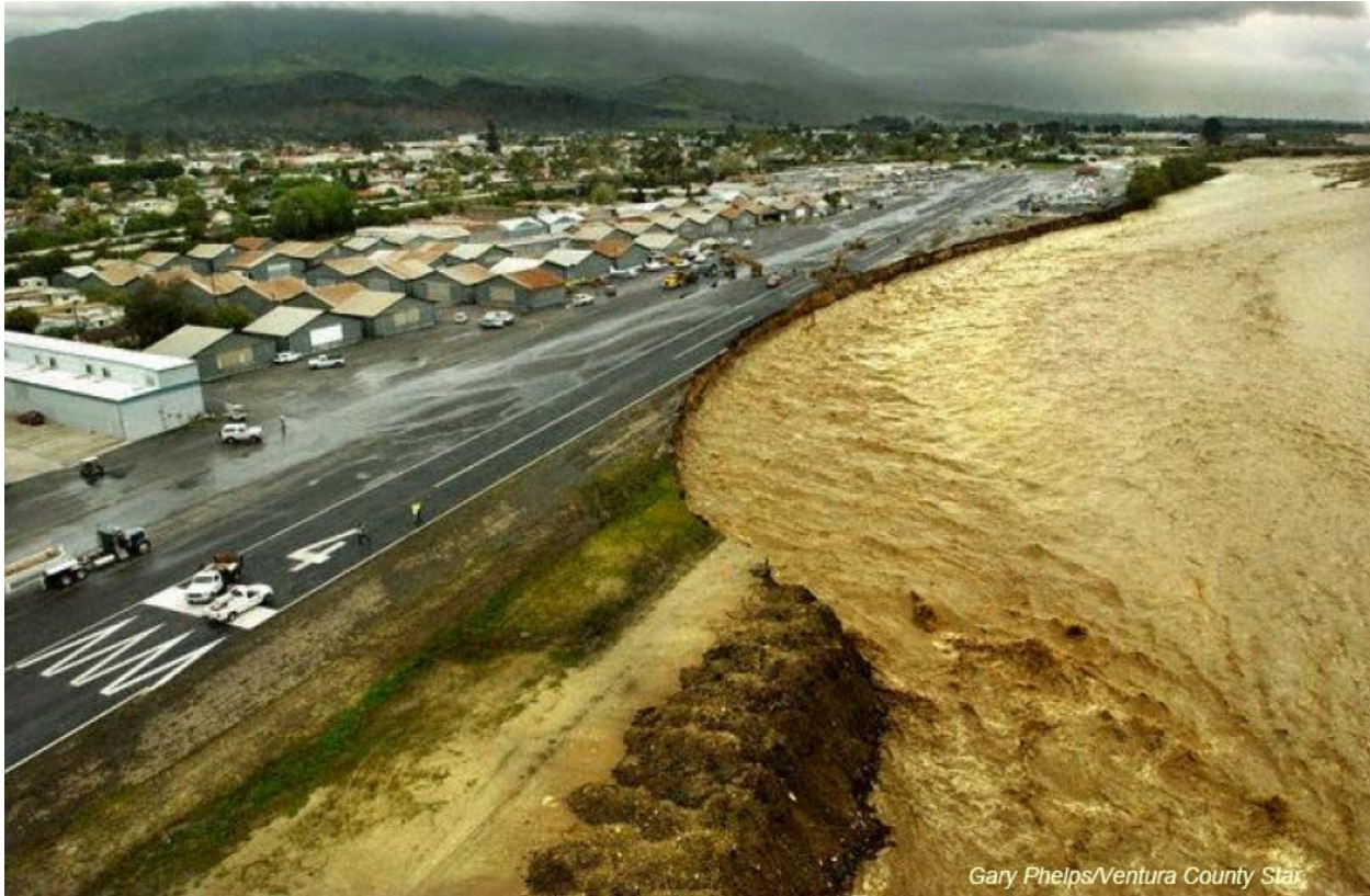
Figure 11. The Santa Clara River at the Santa Paula Airport during a rainstorm on February 23, 2005 (Phelps 2005; Harvey 2008).

turn, benefit long term conservation and restoration of native riparian habitat and associated wildlife species.