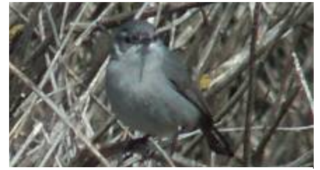
Figure 8. California gnatcatcher (Dellith 2008).

The sensitive reptiles and amphibians of the SCR watershed include: