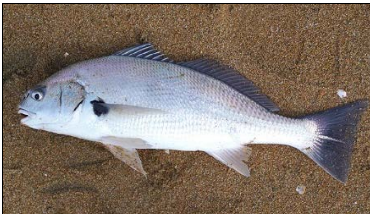
Spotfin croaker, Roncador stearnsii .