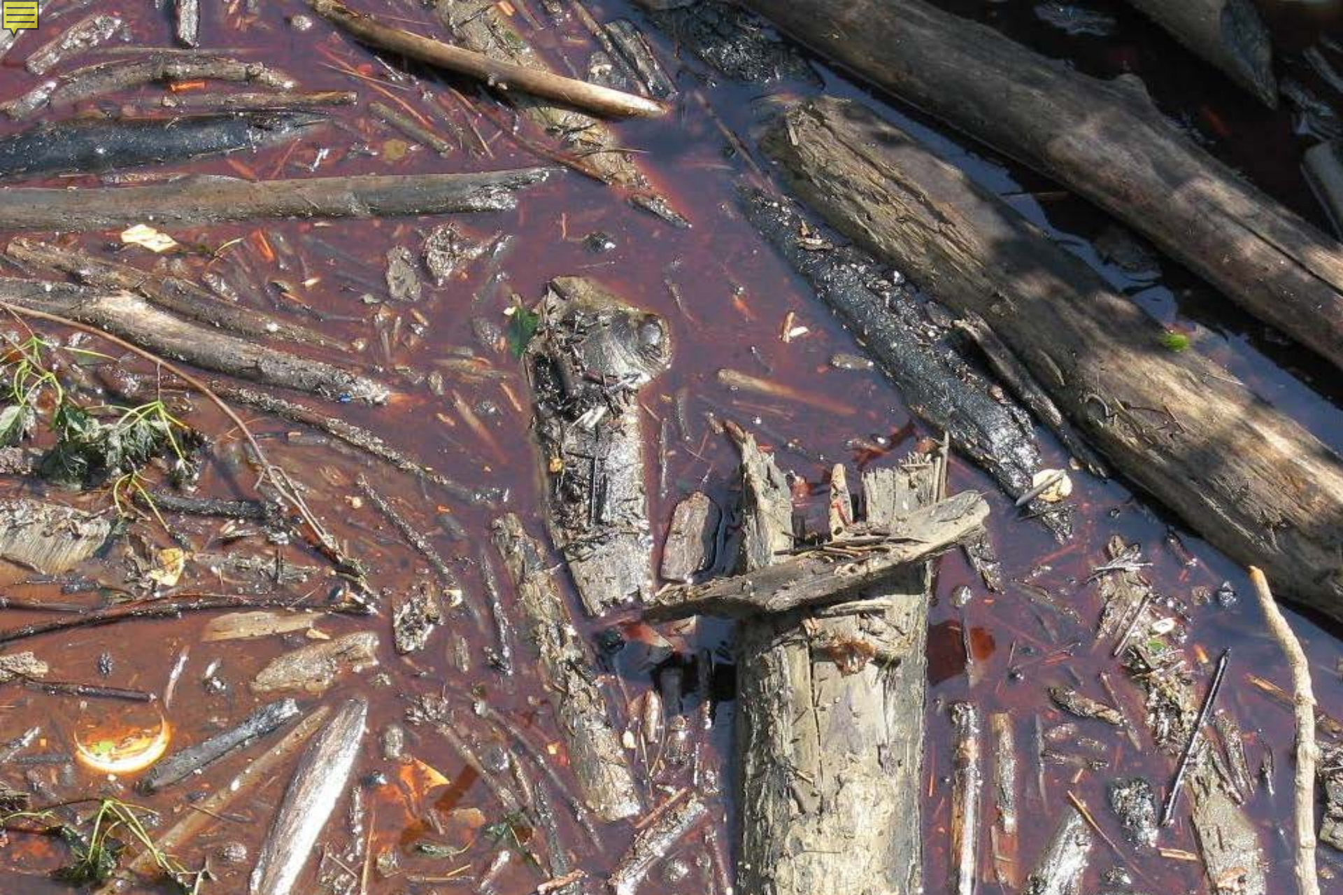
Diesel and oil contaminated debris.