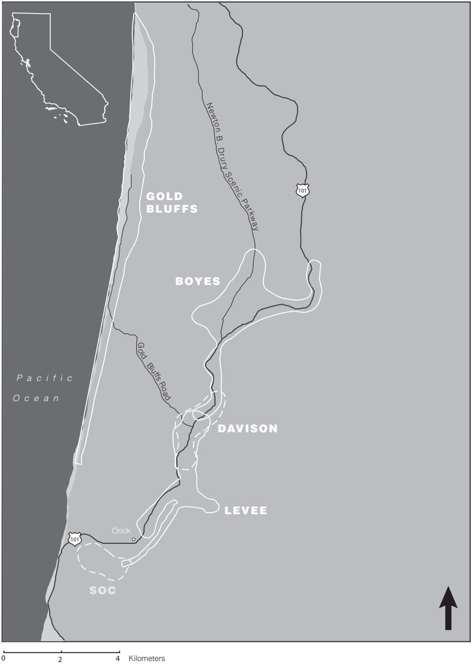
FIGURE 1. —Map of the Prairie Creek and Lower Redwood Creek drainages in Redwood National and State Parks, Humboldt County, California, showing herd ranges of Roosevelt elk described in this paper. The ranges were delineated based on locations where elk were observed from 1997–2010. There were 10 counts each year (except for 1998 and 1999 when only 5 counts occurred) for the Boyes and Davison groups, and one to four counts each year of the other groups.