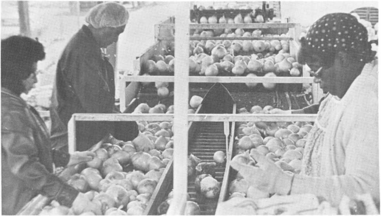
Onion sorting and grading