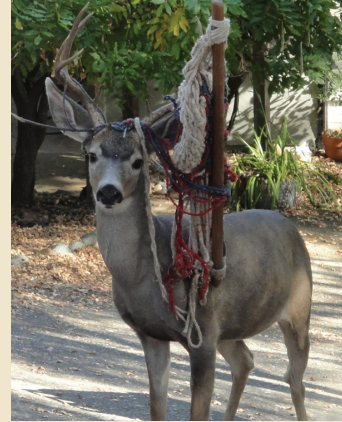
A hammock became entangled in this deer's antlers.