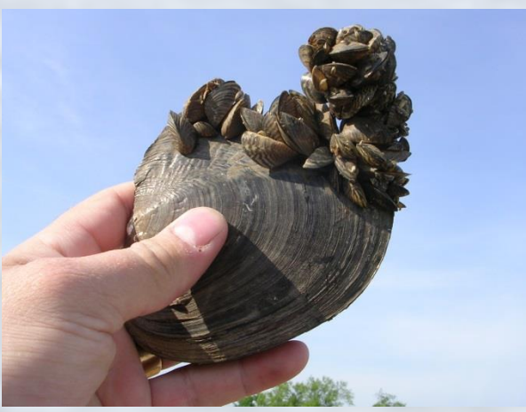
Zebra mussels attached to native mussel.

Shell – 2-shelled (bivalve), may have dark colored "threads" on one edge.