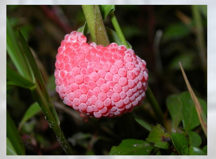
Egg mass.

Shell – Single shell with compact, deeply grooved whorls.