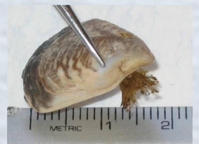
Quagga mussel showing 'threads.'

Dreissena rostriformis bugensis and D. polymorpha