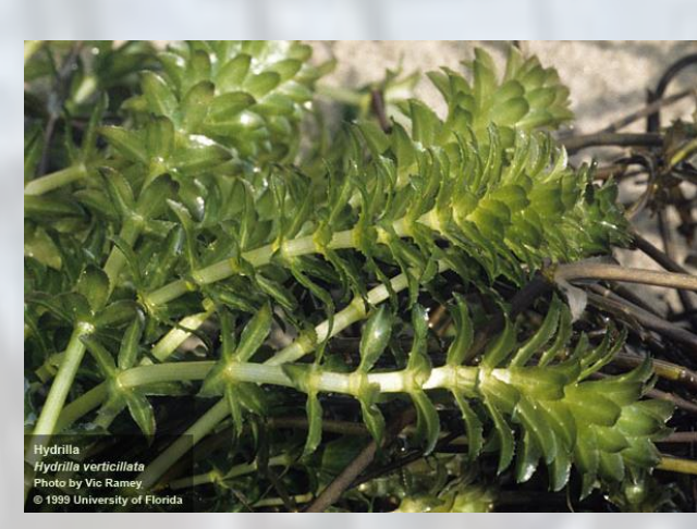
Hydrilla stems.