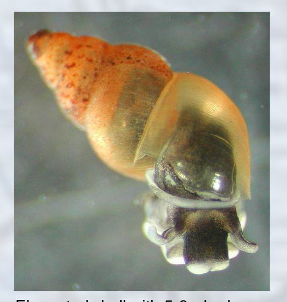
Elongated shell with 5-6 whorls.