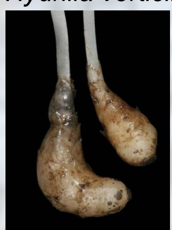
Root tubers.