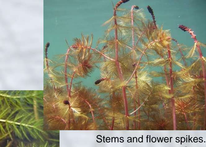
Stems and flower spikes.

Stems – Branched and 20-30" long, reddish-brown or whitish-pink. Leaves – Arranged circularly around the stem in groups of 3-6 (usually 4). Each leaf is less than 2" long, soft, and feather-like.