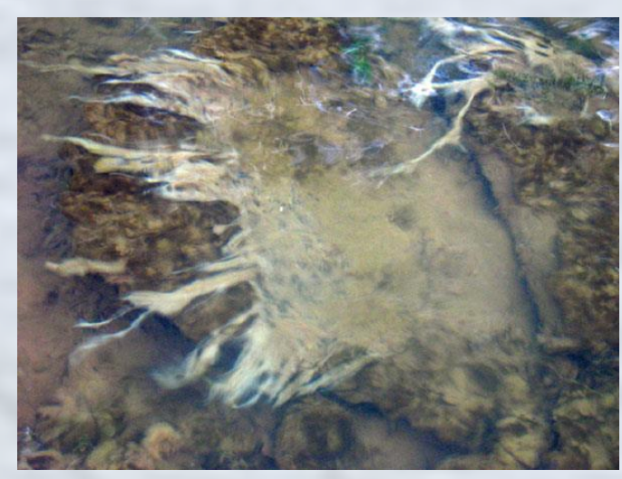
Thick mat (advanced stage) of didymo attached to rock.

Algae – Appears slimy, but feels coarse, like damp wool. Can look like wet toilet paper in streams.