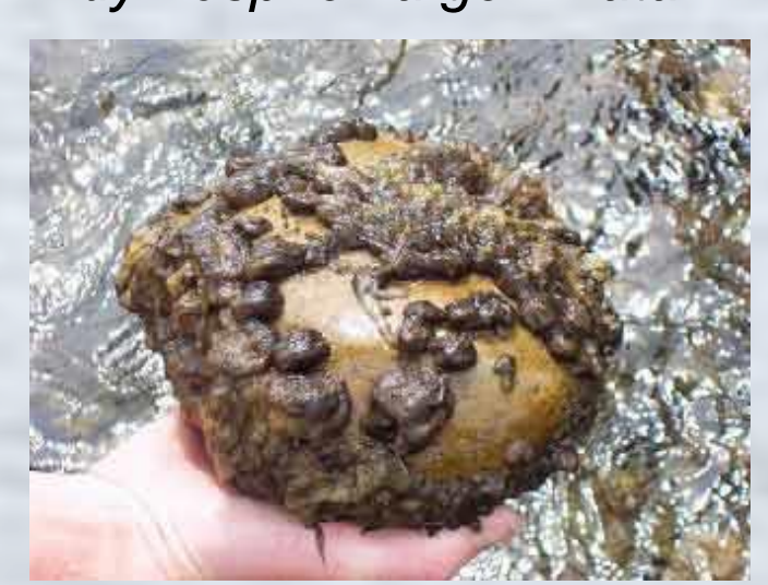
Clumps (early stage) of colonized didymo.