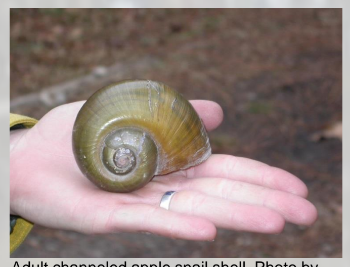
Adult channeled apple snail shell.