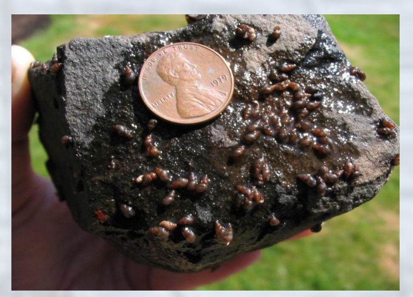
Dense colony of New Zealand mudsnails attached to the underside of a rock.

Shell – Single, elongated, right-handed coiling shell, usually consisting of 5-6 whorls, and an operculum (flap covering the shell opening).