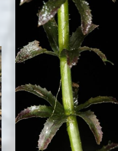
Saw toothed leaves.

Stems – Slender, branched, up to 25' long, and green.