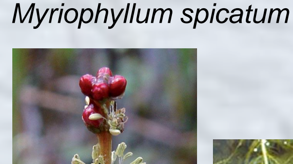
Flower spike.