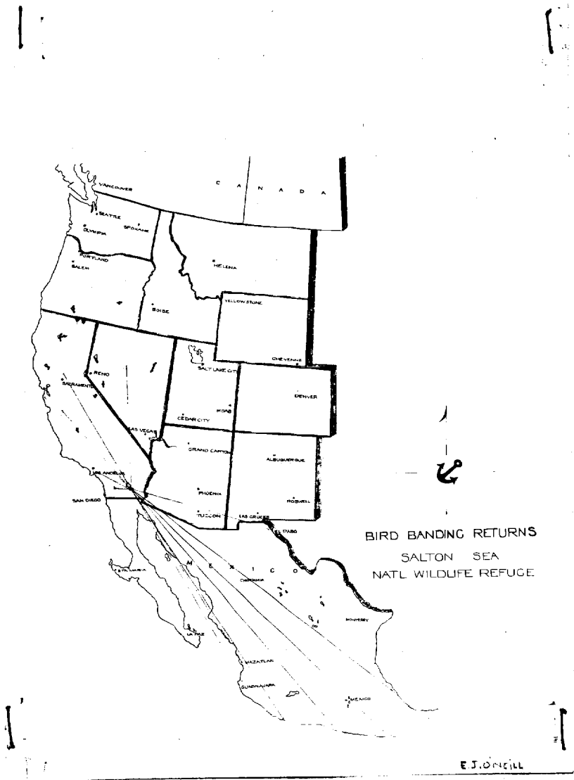
Above map shows returns from White Pelicans banded as nestlings at Salton Sea.

We are indebted to Mr Gallup for part of the information contained in the migration map shown below.