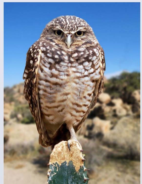
California burrowing owl