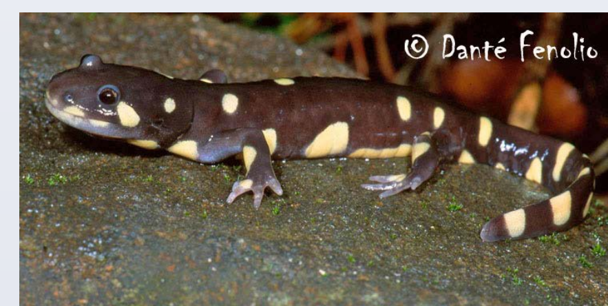
California tiger salamander