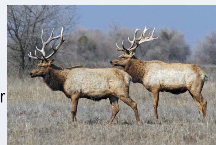
Tule elk