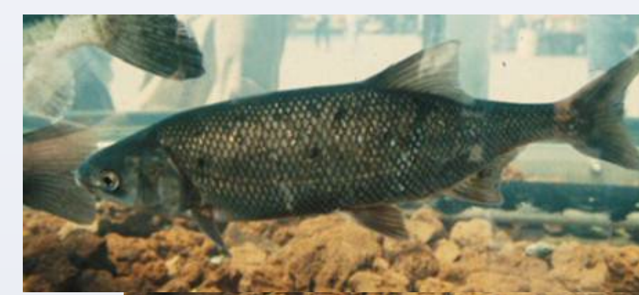
Clear Lake hitch, photograph courtesy of Rick Macedo