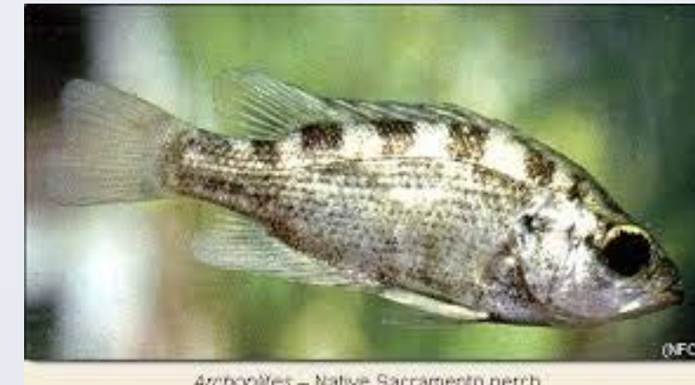
Ancipitici - native Sacramento perch