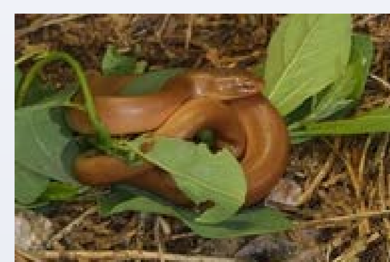
Rubber boa