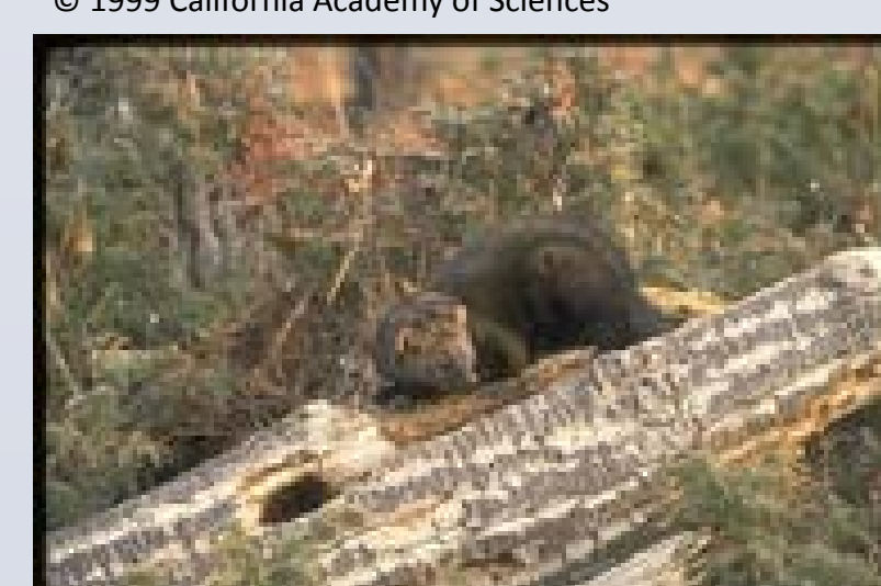
Pacific fisher.