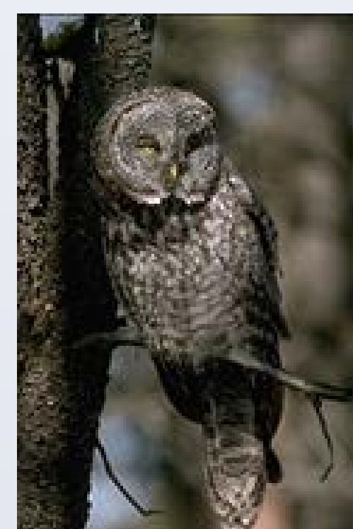
Great gray owl.