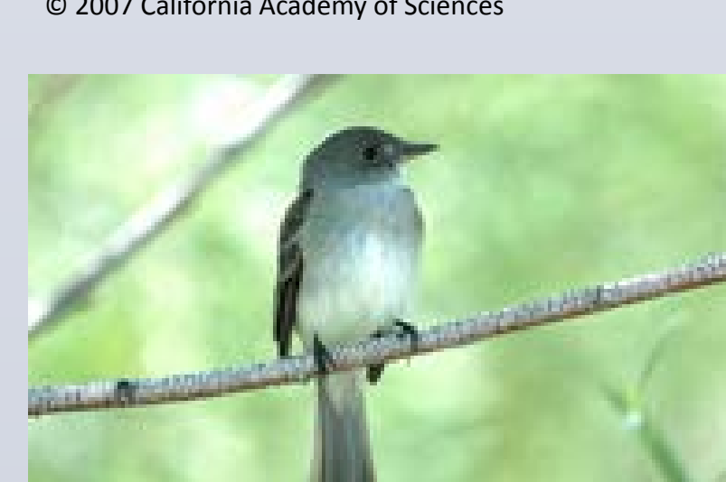
Willow flycatcher