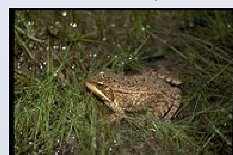
Cascade frog.