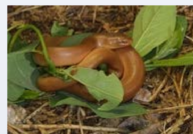
Rubber boa

LONG-TOED SALAMANDER BRUSH RABBIT DUSKY-FOOTED WOODRAT MOUNTAIN BEAVER SPOTTED OWL BALD EAGLE PEREGRINE FALCON RUBBER BOA GOLDEN EAGLE RINGTAIL AMERICAN BADGER AMERICAN MARTEN BLACK SWIFT DEER MOUSE FISHER LONG-EARED MYOTIS MOUNTAIN LION NORTHERN FLYING SQUIRREL NORTHERN GOSHAWK OLIVE-SIDED FLYCATCHER OSPREY PURPLE MARTIN SNOWSHOE HARE SOOTY GROUSE VAUX'S SWIFT WESTERN SPOTTED SKUNK WESTERN TAILED FROG YELLOW WARBLER