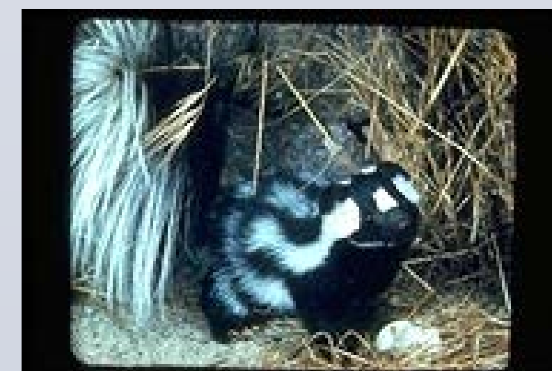
Spotted skunk