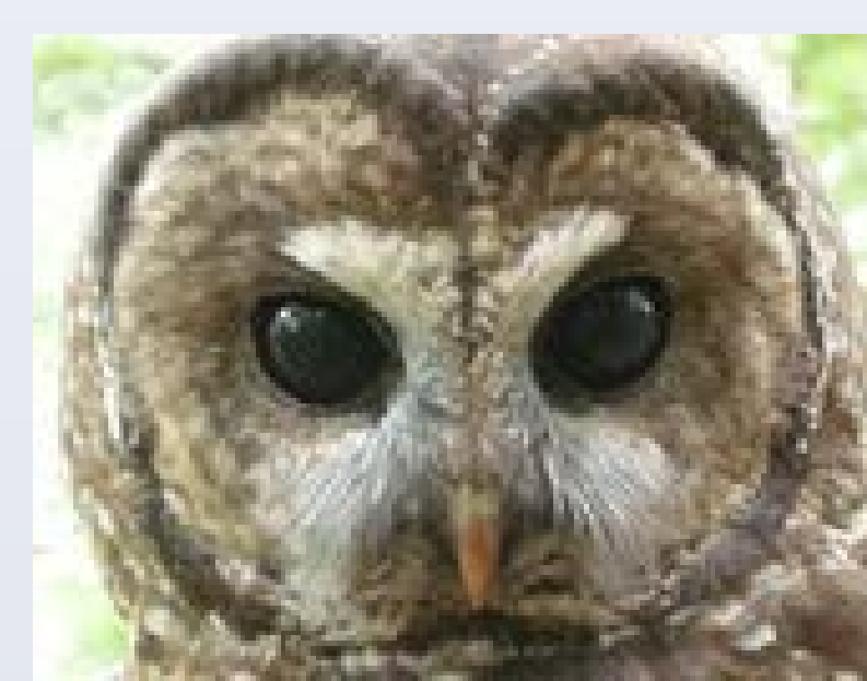
Northern spotted owl