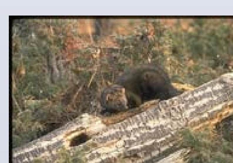
Pacific fisher