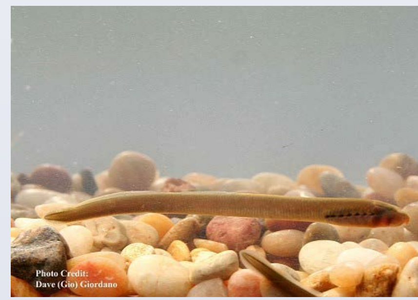
Goose Lake Pit-Klamath brook lamprey