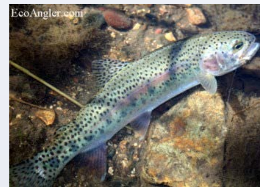
Goose Lake redband trout