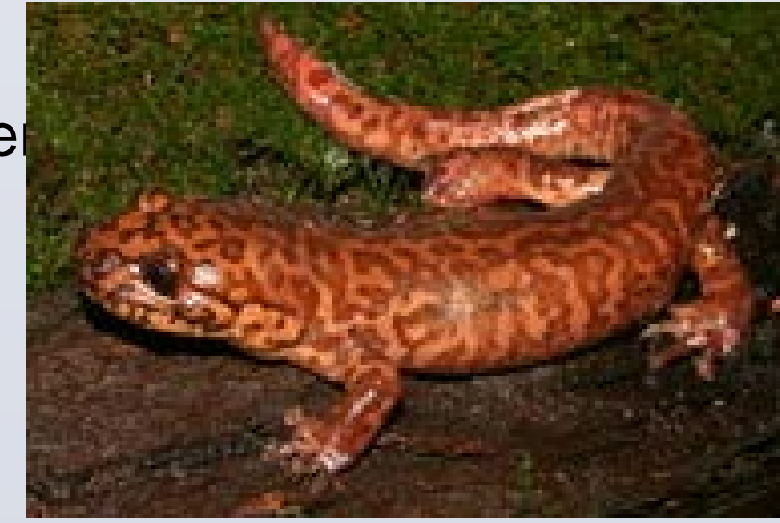
California giant salamander