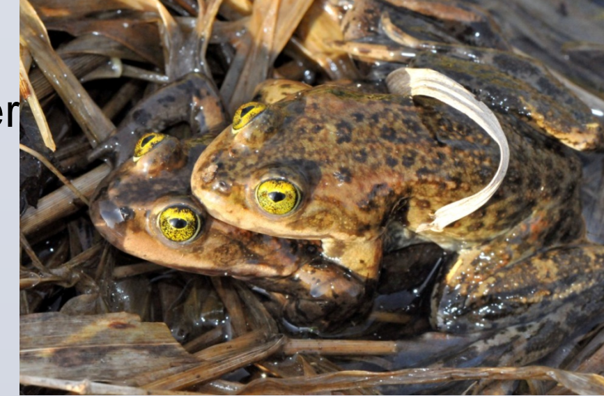
Oregon spotted frog