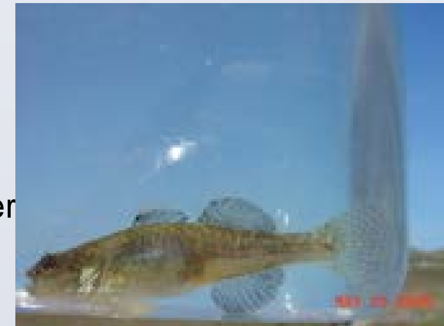
Tidewater goby