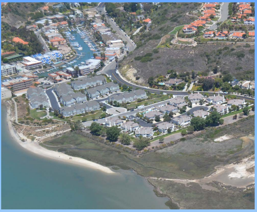
Aqua Hedionda Lagoon.