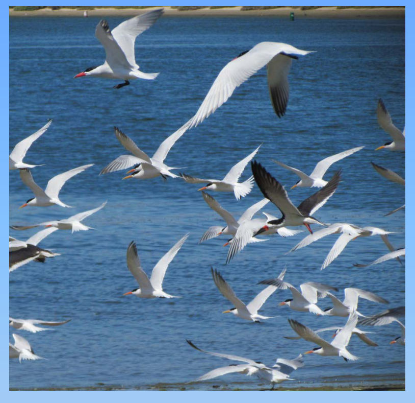
California Least Terns & Black Skimmer.

Light-footed Clapper Rail.