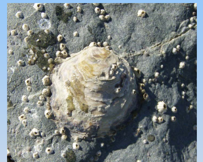
Robin Madrid, CDFW

Decrease in native species populations including shorebirds and bivalves