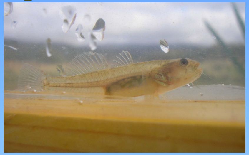
Tidewater Goby.