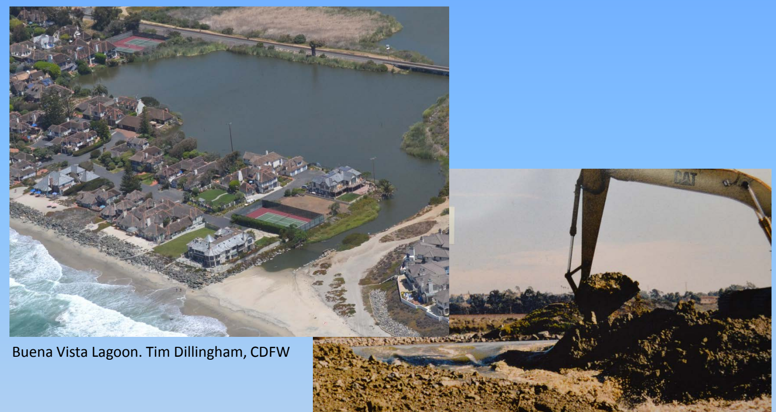
Batiquitos Lagoon.