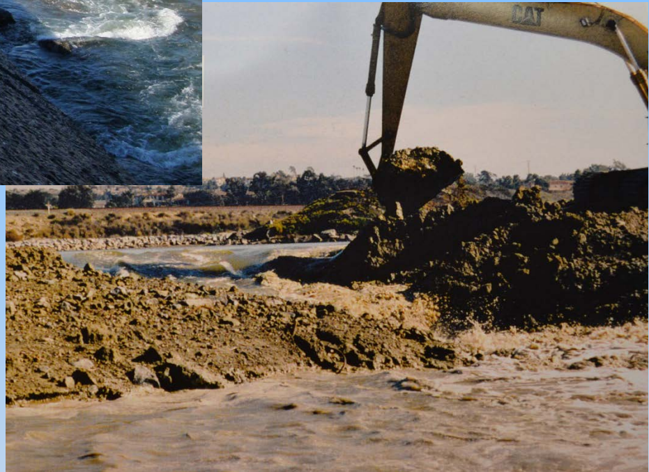
Batiquitos Lagoon.