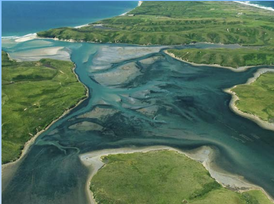
Drakes Estero.