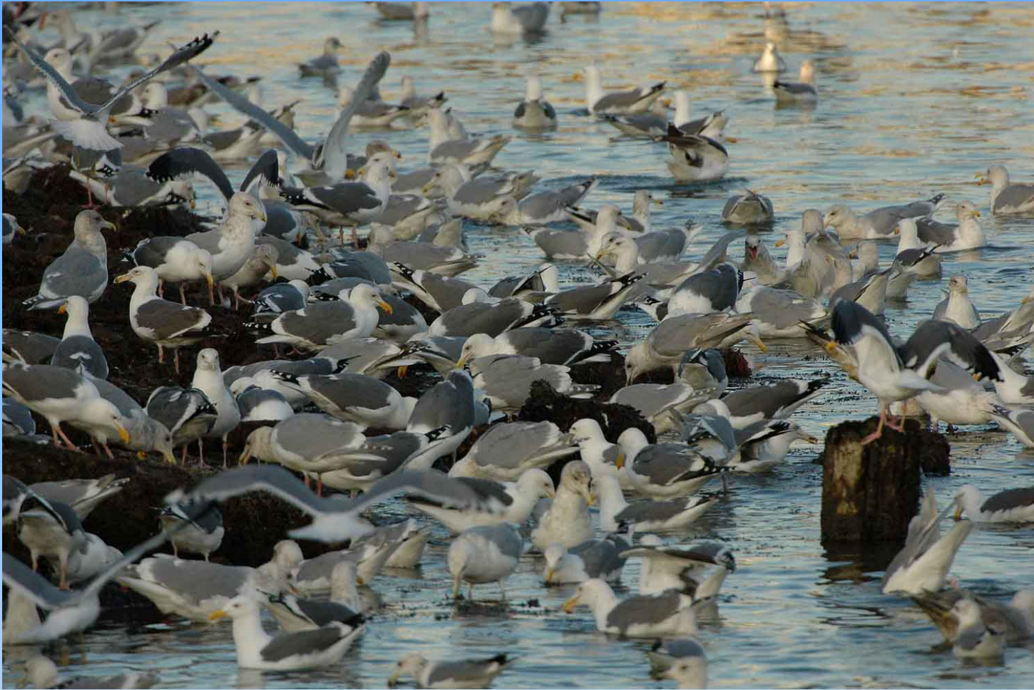
Herring Spawn Event.