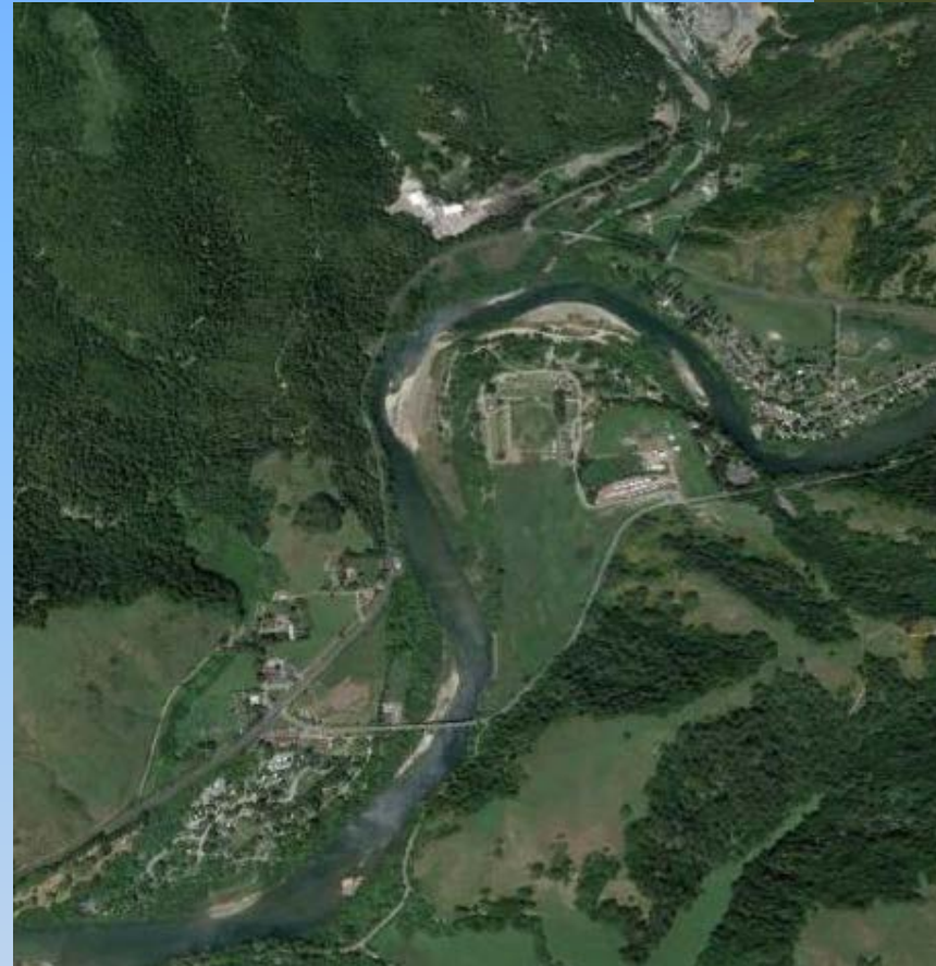
Russian River.