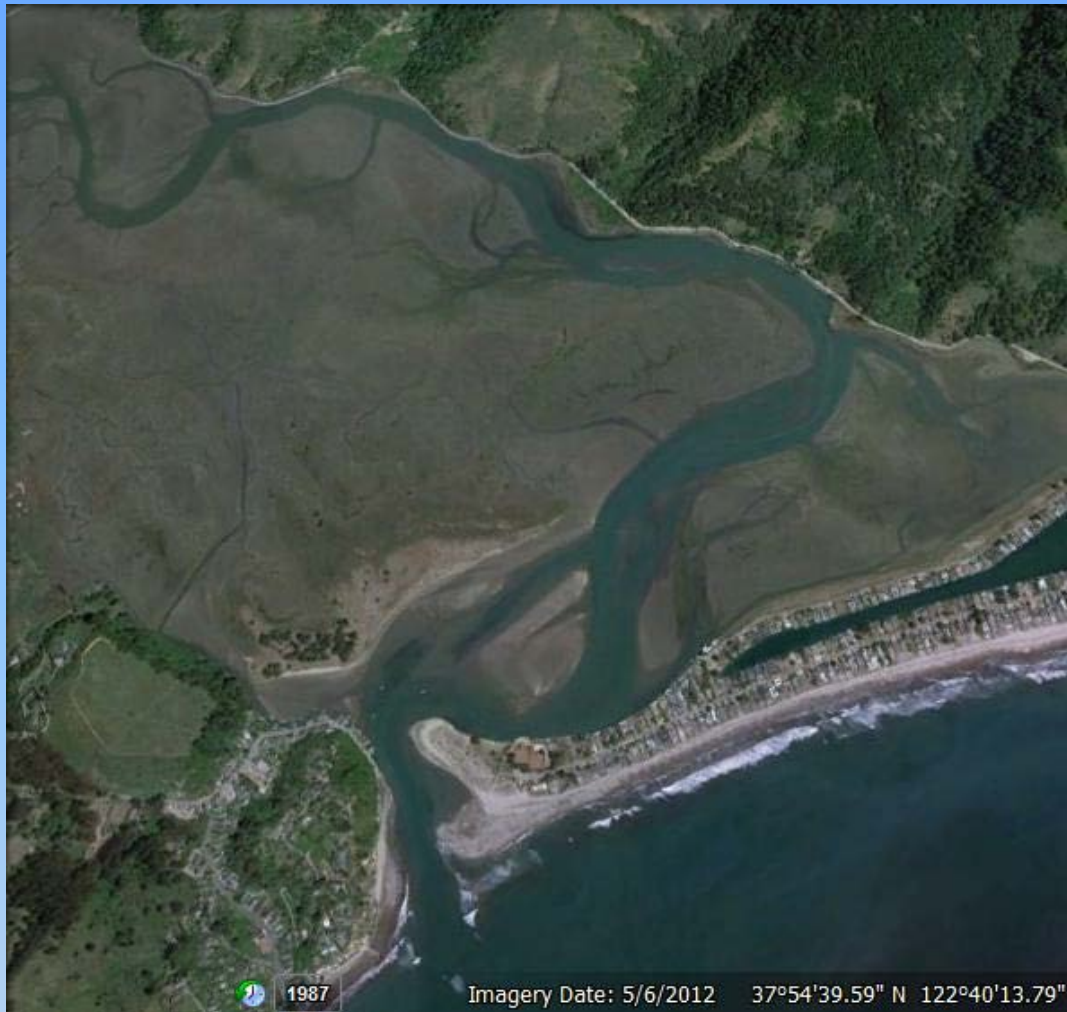
Bolinas Lagoon. Google Earth