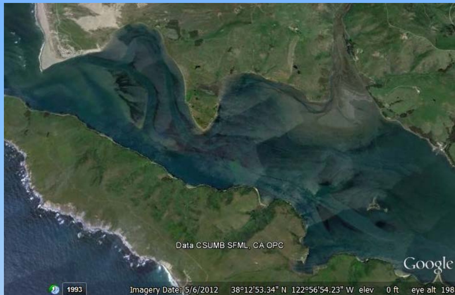
Tomales Bay – Tidal Bay. Google Earth