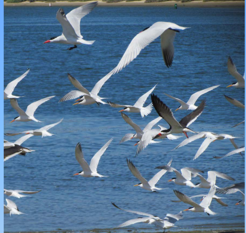
California Least Terns & Black Skimmer.