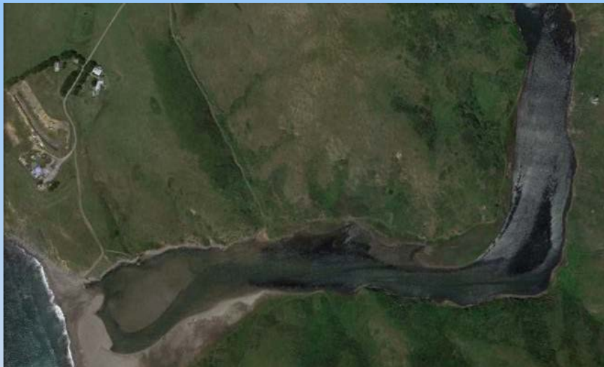
Estero Americano– River Mouth.