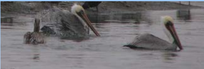
Brown Pelicans.