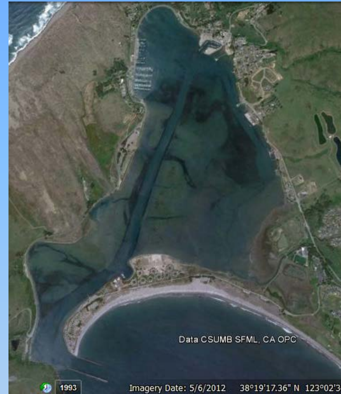
Bodega Bay – Classic Estuary. Google Earth