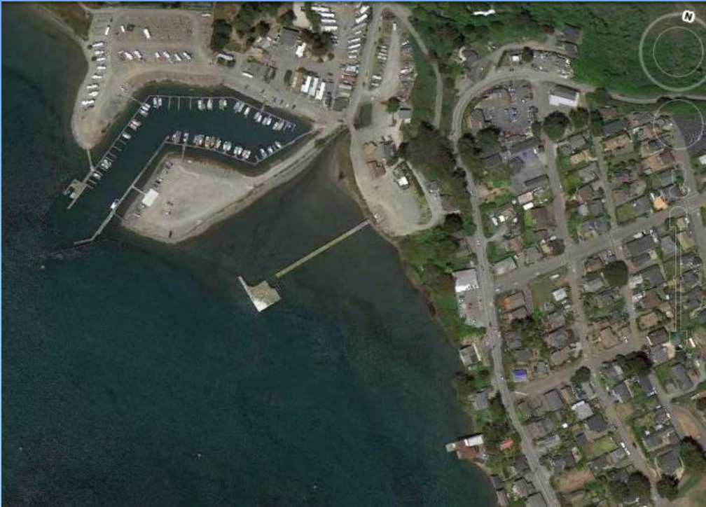
Bodega Bay.