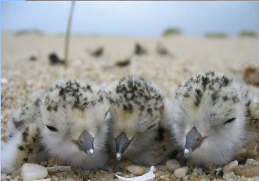
Snowy Plovers. Jenny Erbes, Point Blue Conservation Science