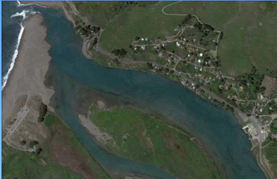
Russian River – River Mouth.