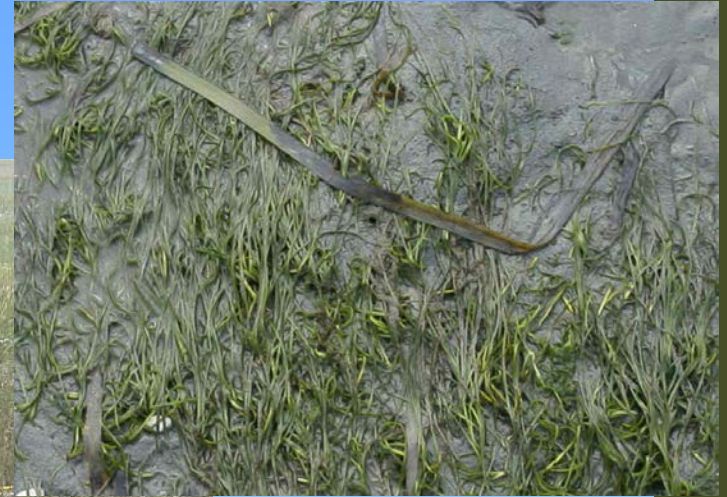
Zostera japonica.