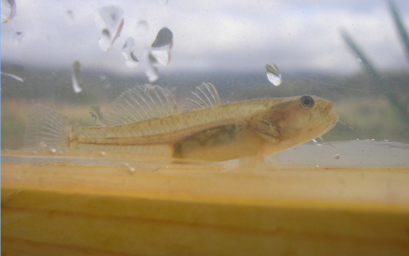
Tidewater Goby.