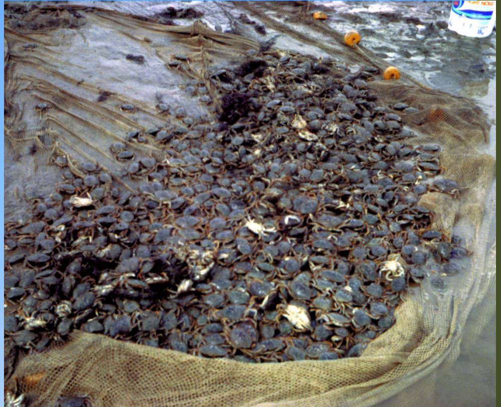
Juvenile Dungeness Crabs.