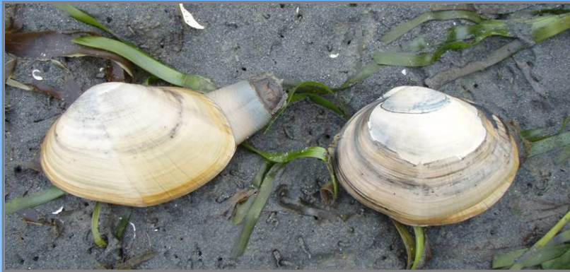
B. McVeigh, CDFW