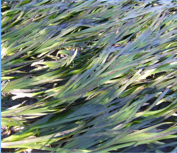
Seagrasses. Kirsten Ramey, CDFW