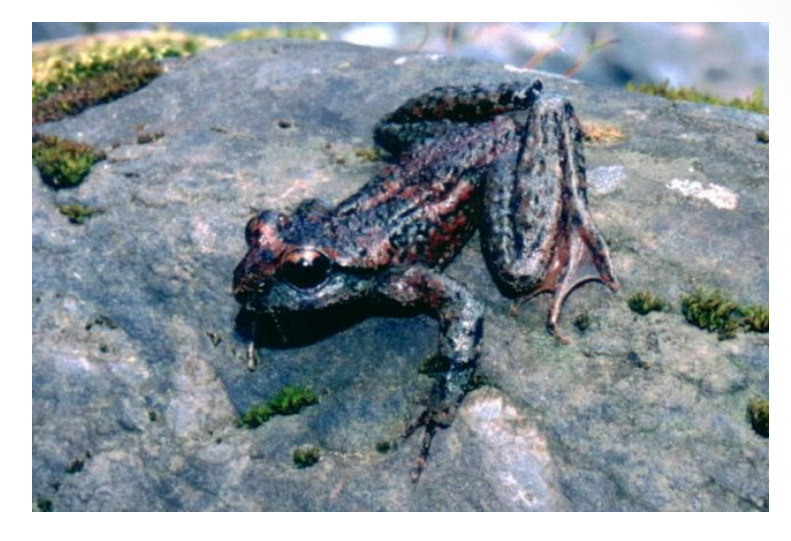
Western Tailed Frog