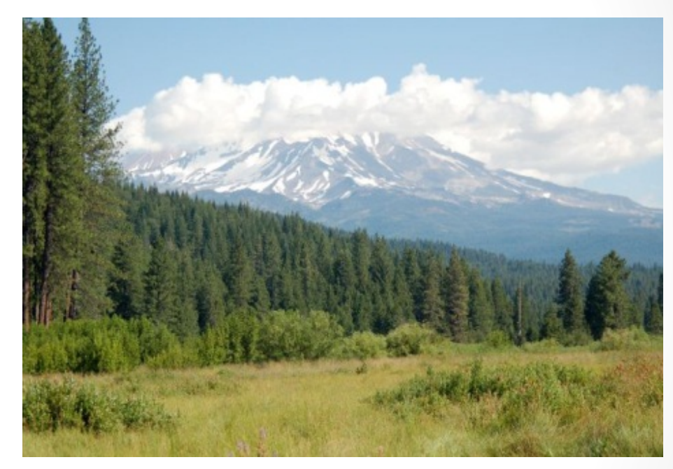
Mt. Shasta from McCloud area