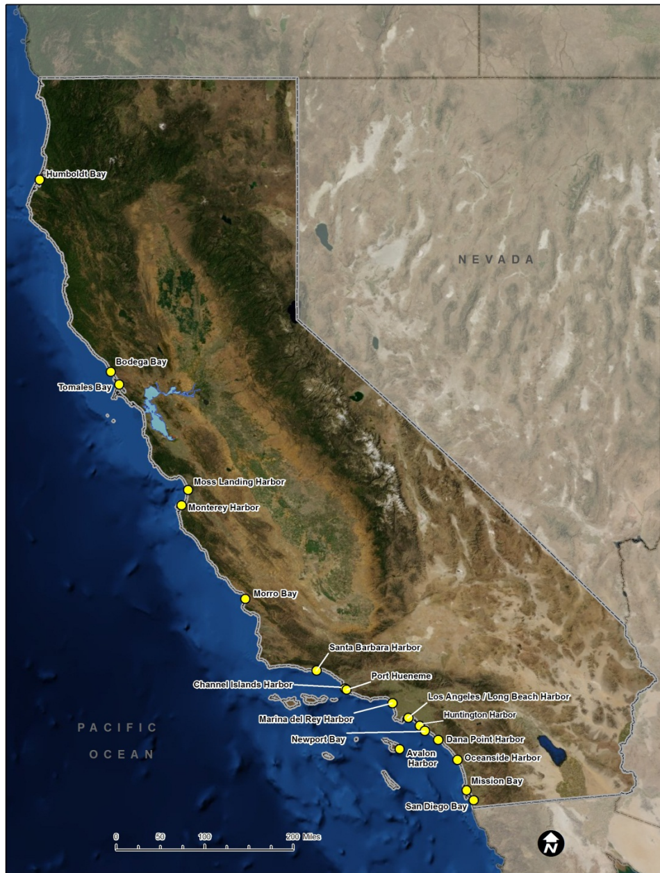
Figure 1. California bays and harbors surveyed in the current study.