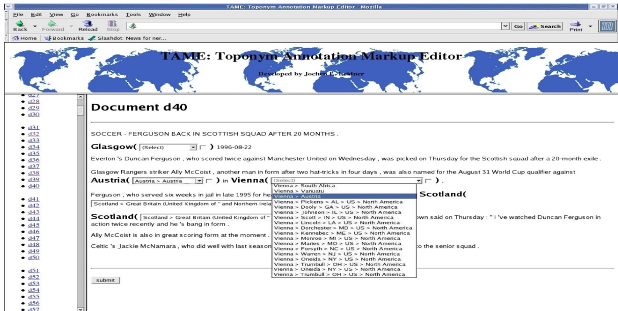
Figure 3: TAME, the Toponym Annotation Markup Editor (screen shot).

corpus such as the one being constructed in the project described here.