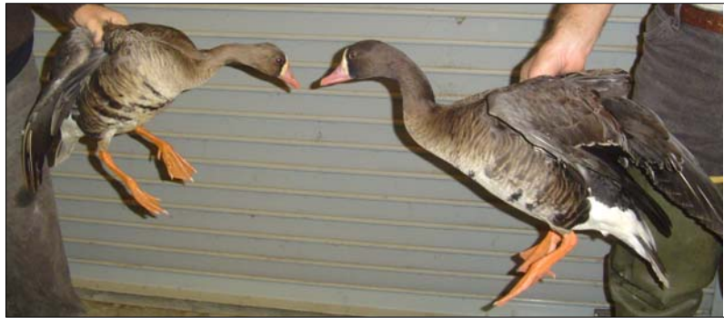
Adult Pacific White-fronted goose

The delayed opening date, lower bag limit, and mid-December closure are intended to reduce the harvest of Tule Greater White-fronted Geese. The Tule goose population is small in size and is concentrated in winter in the western Sacramento Valley - especially the Sacramento, Delevan, and Colusa NWRs. By mid-December, Tule geese are a larger proportion of the white-fronted goose population in the special management area. The area was created in 1975 to eliminate the harvest of the then-endangered Aleutian Canada goose. Cackling Canada geese and Pacific white-fronted geese were included when both populations were at record low levels. Because of the small population of Tule geese, restrictive hunting regulations continue to be necessary.