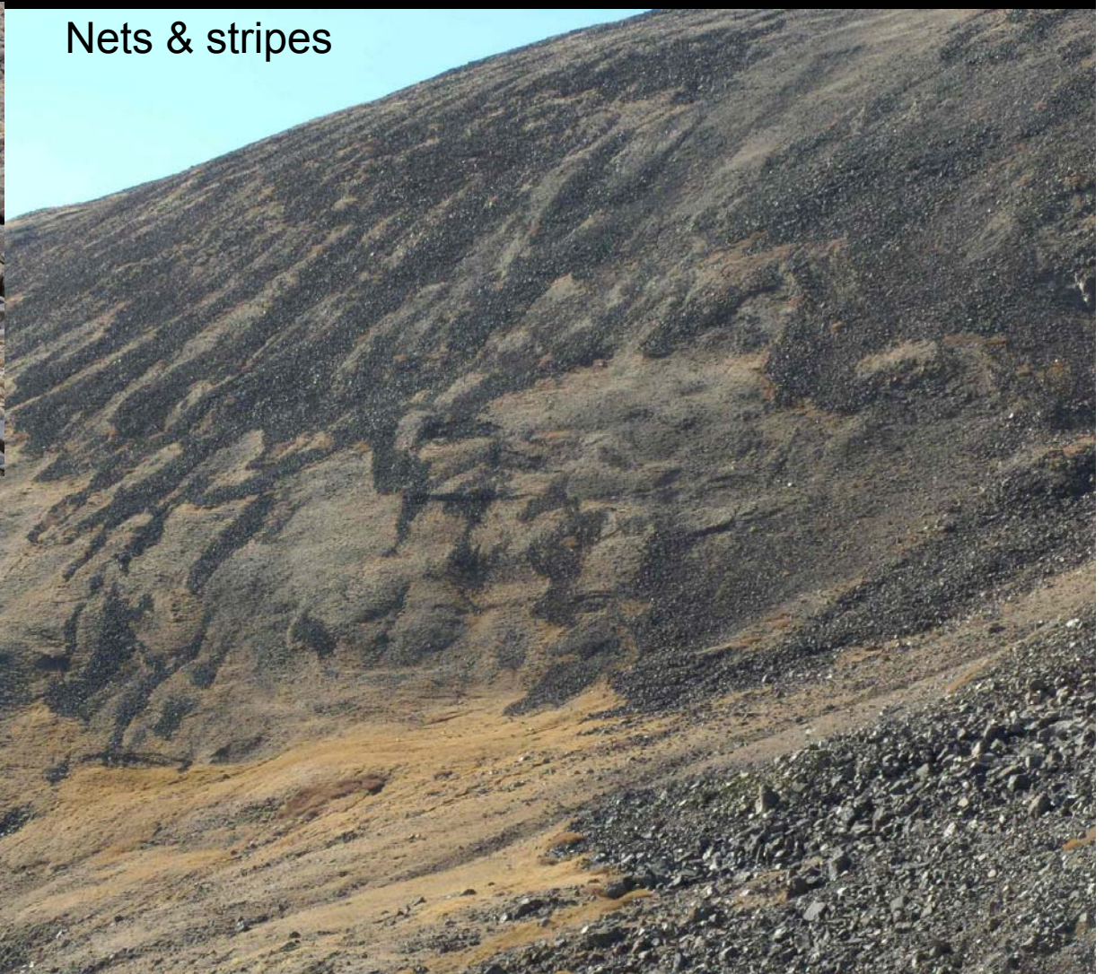
Nets & stripes