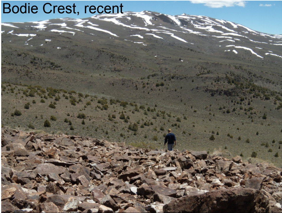
Bodie Crest, recent