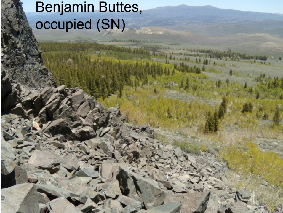
Benjamin Buttes, occupied (SN)