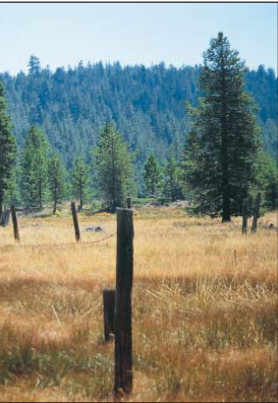
Photo above center, view of Butte Creek Canyon Ecological Reserve. Just two miles southeast of Chico and about 40 miles downstream from Butte Creek House ER is DFG's Butte Creek Canyon Ecological Reserve. Above right and below center, taken at Butte Creek House Ecological Reserve.

Nevada mountain beaver or the Pacific fisher, all unique in their own way. The snowshoe hare, for example, has large hind feet which work like snowshoes and help it move more easily through the snow. Its brown coat turns white in the winter to help camouflage it from predators. The mountain beaver excavates networks of burrows, navigating its underground spaces with the help of whiskers and extra-long leg hairs. One of the few species that will take on a full-grown porcupine, the fisher (a weasel family relative) might hunt here, among the winter snowdrifts. Black-tailed deer also winter in the Butte Creek area, where food is plentiful and the weather is warmer.